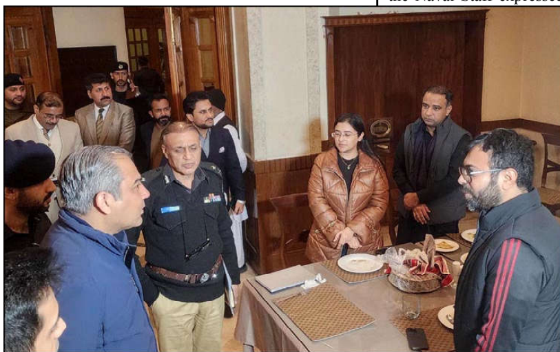
ISLAMABAD: Federal Minister for Interior Mohsin Naqvi meeting the under training officers during his visit to National Police Academy.

Following the police crackdown against PTI's November 26 protest in the federal capital, the former ruling party claims that 13 of their supporters were killed, 58 sustained injuries and 45 are still missing.