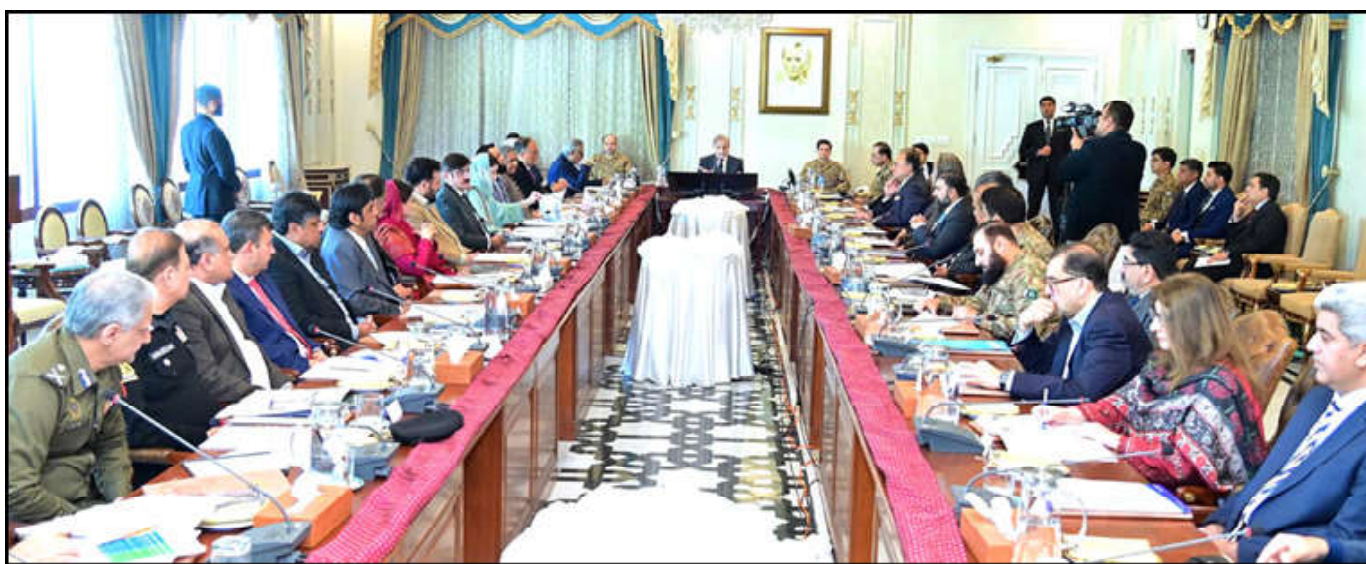
ISLAMABAD: Prime Minister Muhammad Shehbaz Sharif chairs the meeting of Apex Committee of National Action Plan.