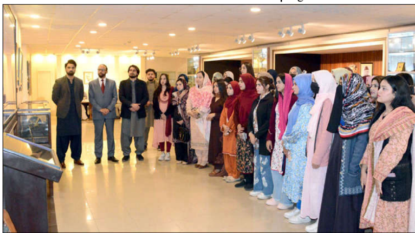
ISLAMABAD: Students and faculty Members of Rawalpindi Women University Visiting Senate Museum at Parliament House, in Federal Capital.

ISLAMABAD (APP): Indus River System Authority (IRSA) on Friday released 28,100 cusecs water from various rim stations with inflow of 39,100 cusecs. According to the data released by IRSA, water level in River Indus at Tarbela Dam was 1473.51 feet and was 75.51 feet higher than its dead level of 1,398 feet. Water inflow and outflow in the dam was recorded as 16,200 cusecs and 6,000 cusecs respectively. The water level in River Jhelum at Mangla Dam was 1132.95 feet, which was 82.95 feet higher than its dead level.