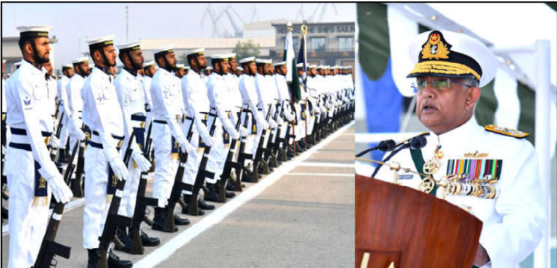
Chief of the Naval Staff Admiral Naveed Ashraf addressing parade during Fleet Efficiency Competition Parade 2024.

PM Shehbaz Sharif on the occasion congratulated the nation as Pakistan assumed non-permanent membership of United Nations Security Council.