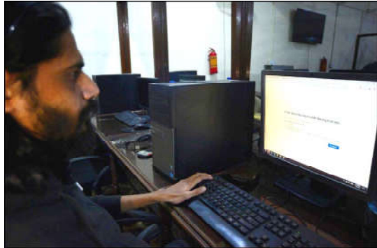
KARACHI: Citizens are facing internet connectivity issues, in Karachi.

The Provincial Ombudsman Sindh took notice of the application and sent a notice to the LDA authorities. Later, after holding several hearings, the LDA authorities provided the complainant.