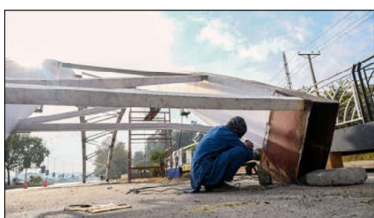
ISLAMABAD: Bridge maintenance in progress as laborers work diligently on Srinagar Highway.