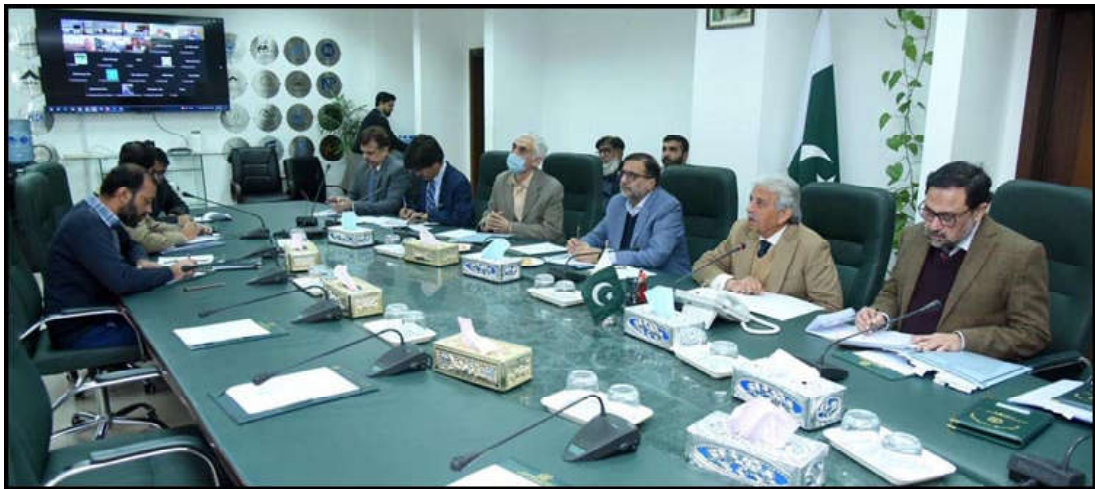
ISLAMABAD: Meeting of Sugar Advisory Board under the Chairmanship of Federal Minister Rana Tanveer Hussain.