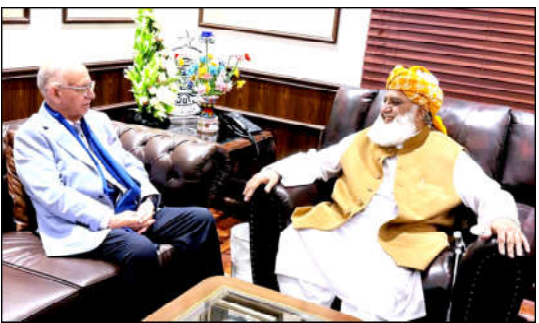
ISLAMABAD: Senator Irfan-ul-Haq Siddiqui, spokesperson for the government negotiation committee, meets with JUI-F chief Maulana Fazlur Rehman at his residence.

He also commended Rehman's role in amicably resolving the issue of religious seminaries' registration.