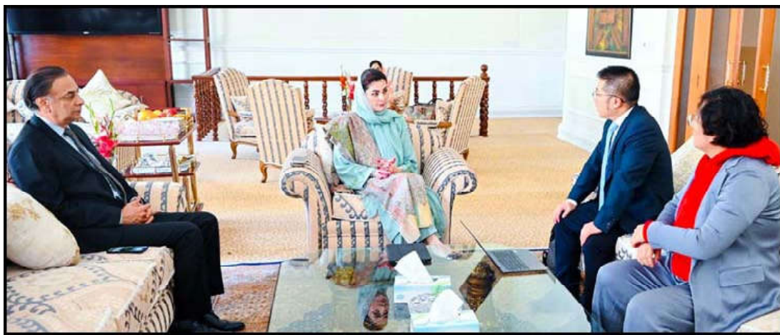
LAHORE: Punjab Chief Minister, Maryam Nawab Sharif exchanging views with a high level delegation from China during meeting held at Punjab House.