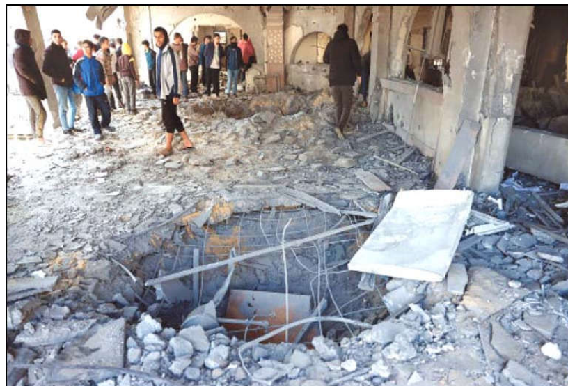
KHAN YUNIS: Palestinians check a crater caused by an Israeli strike that hit an administrative building in the southern Gaza Strip.

The U.S.-led talks have repeatedly stalled during 15 months of war, which was sparked by Hamas-led militants' Oct. 7, 2023 attack into Israel. The militants killed some 1,200 people, mostly civilians, and abducted around 250.