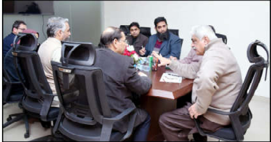
LAHORE: Punjab Minister for Health Khawaja Salman Rafique presides over the important meeting at Punjab Pharmacy Council.

The petition urged the PHC to suspend the recent notice and restrain the ECP from initiating further proceedings, describing the notices as a "sword hanging over the head" of the CM.