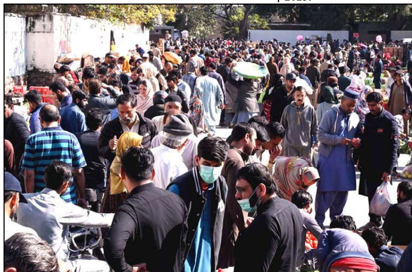
ISLAMABAD: A large number of people purchasing fruits and vegetables for iftar at Sasta Ramadan bazaar Aabpara in the Federal Capital.

The negotiations between Pakistan and the IMF Review Mission will conclude on March 15, 2025. The release of the second installment will conclude on March 15, 2025.