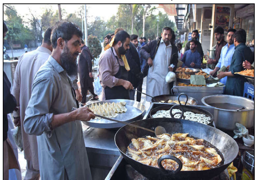
ISLAMABAD: People buy fritters for iftar on the first day of the Islamic holy fasting month of Ramadan, in the Federal Capital.

Born in Ambala in 1925, passed his matriculation examination from Muslim High School Ambala and got admission in Government College Lahore for bachelor degree but he had to leave education due to the unrest witnessed during the partition of the sub-continent. Nasir Kazmi worked in Welfare Department for some time and then in the Agriculture Department. While associated with Radio Pakistan, Nasir Kazmi wrote sketches of classical Urdu poets Mir Taqi Mir, Nazir, Wali, Insha and so on, which became very popular.