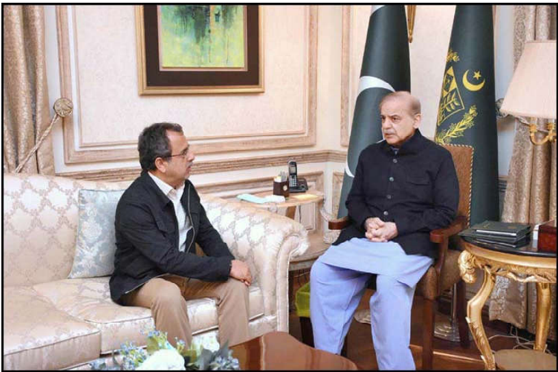
LAHORE: Federal Minister for Power Sardar Awais Ahmed Leghari calls on Prime Minister Muhammad Shehbaz Sharif.

Similarly, five sahalat relief bazaars were established at key locations, including Tanki Ground block no. 5 in Bhalwal, opposite MC Offices in Sahiwal and Sillanwali tehsils, near Ghaara Bus Stand in Kot Momin tehsil, and close to the post office in Shahpur tehsil.