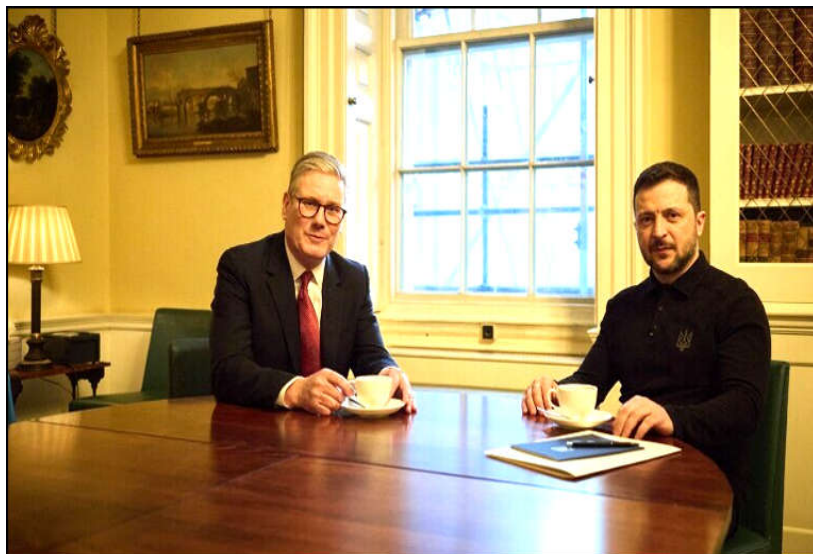
Ukraine's President Volodymyr Zelensky and Britain's Prime Minister Keir Starmer pose for a photo during their talks in London.

With fears growing over whether the United States will continue to support Nato, the meeting will also address the need for Europe to increase defence cooperation.