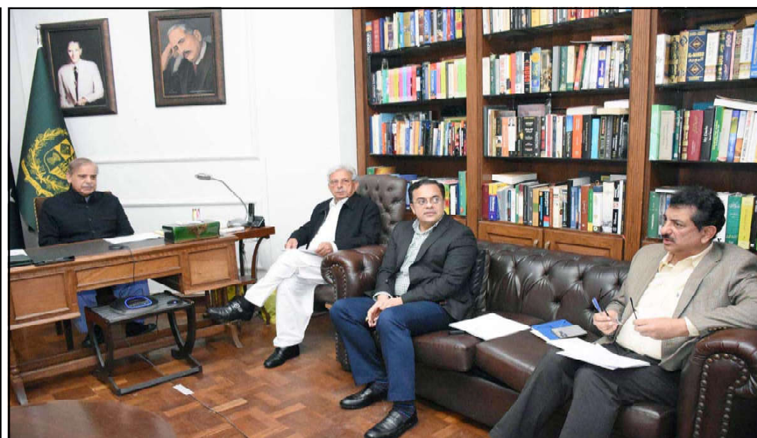
LAHORE: Prime Minister Muhammad Shehbaz Sharif chairs a meeting on supply and price control of Sugar.

Deputy Prime Minister and Foreign Minister Muhammad Ishaq Dar, Federal Minister for Planning and Development Ahsan Iqbal, Federal Minister for Economic Affairs Ahad Cheema, Federal Minister for Industries and Production Rana Tanveer Hussain, Federal Minister Ali Pervaiz Malik and other high-ranking officials attended the meeting. Chief secretaries of all provinces also attended the meeting via video link.