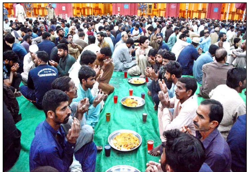
KARACHI: A large number of faithful offering dua before break their fast at New Memon Masjid on the first day of holy fasting month of Ramadan.

Through participatory dialogue, panelists and audience members examined how women from diverse backgrounds are reshaping social narratives.