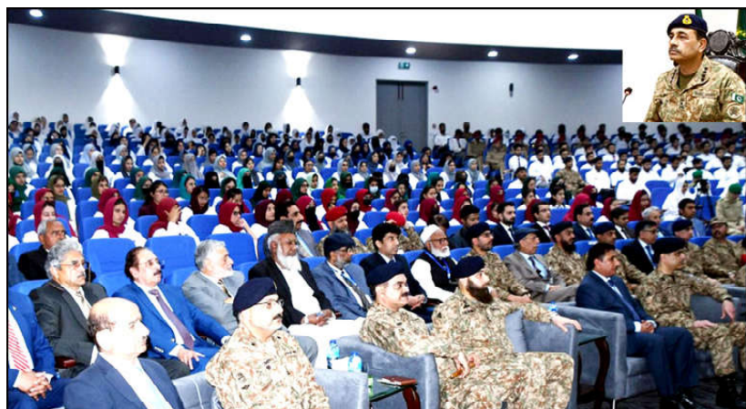
BAHAWALPUR: Chief of Army Staff General Syed Asim Munir interacting with students from various universities in Bahawalpur.