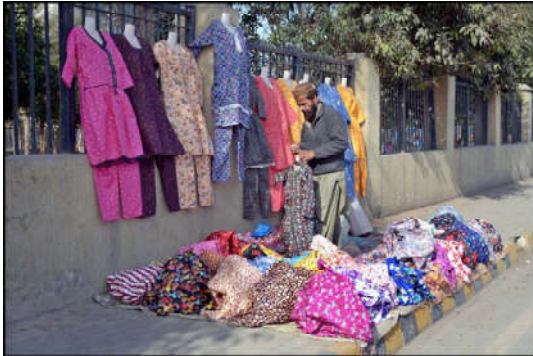
MULTAN: A vendor is arranging and displaying clothes to attract customers at his roadside setup.

He expressed optimism that Pakistan could become a trillion-dollar economy within the next six to seven years if the right economic policies were implemented. He also highlighted the progress in the agriculture sector, noting that rice exports had reached $3.8 billion and total agricultural exports had climbed to $9 billion, shifting Pakistan from an import-driven to an export-driven economy.