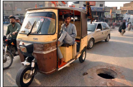
HYDERABAD: Commuters pass through nearby an open sewerage main hole that may cause any accident specially in night hours, showing the negligence of concerned departments, at Bacha Khan Chowk road in Hyderabad.

among 50,000 individuals selected from about more than 90000 applications purely on merit. However, from next year, the number of the beneficiaries would be increased up to 75,000, he added. He said that Rs.4 billion was also allocated for development work in minority residential areas and their places of worship. Special minority scholarships will be introduced to support the students in their education. Plans are also underway to initiate IT education programs and skill-based training for underprivileged minority youth so as to help them to unlock their potential. A special e-learning program would also be launched soon to enhance educational opportunities for minority children.