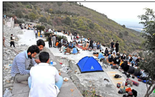
ISLAMABAD: A large number of people are having the Iftar at the broken Former Monal Restaurant Site in on the debris of building at Margalla Hills, in Federal Capital.

The minister further urged everyone to pledge on this day to work tirelessly for Pakistan's development, transforming it into a modern, prosperous, and advanced state, moving beyond mere words and slogans.