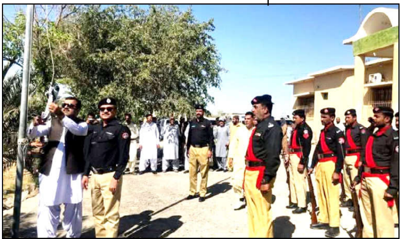
PANJGUR: Deputy Commissioner Zahid Ahmed Lango hoisting national flag on eve of Pakistan Day.

He expressed sorrow over that some elements are trying to do politics on the dead bodies of terrorists. But the government would not let succeed these elements at all, he added. He said that the government has decided to take the war against terrorists to the logical end and ensure protection of public anyway.