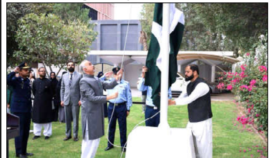
ABU DHABI: Ambassador Faisal Niaz Tirmizi hoisting flag during a ceremony to commemorate Pakistan's National Day at the Embassy.

Pakistan's sovereignty. "We have repeatedly conveyed to Afghan authorities that their land is being used for attacks against Pakistan. He reiterated the government's decision to repatriate illegal foreign nationals, stating that all undocumented individuals must leave Pakistan by March 31, while those with valid documents have until June. The Minister assured that law enforcement agencies are investigating security threats and will take stern measures to prevent unlawful activities.