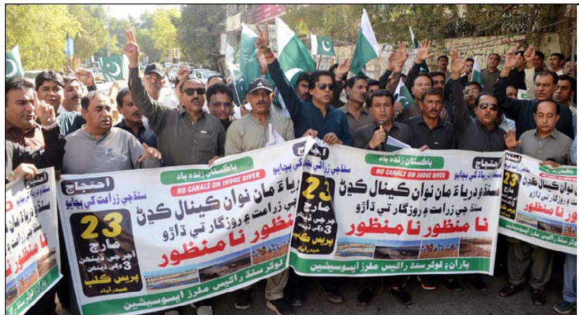
HYDERABAD: Members of Lower Sindh Rice Mills Association hold a protest against construction of six new canals on River Indus outside HPC.