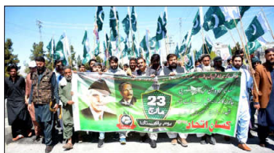
QUETTA: Central Chairman Kissan Ittehad leading a rally in connection with Pakistan Day.