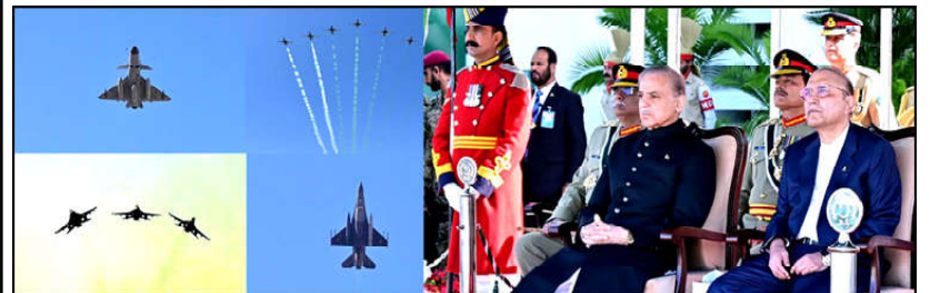
ISLAMABAD: President Asif Ali Zardari and Prime Minister Shehbaz Sharif witnessing the Pakistan Day parade ceremony, at Aiwan-e-Sadr.