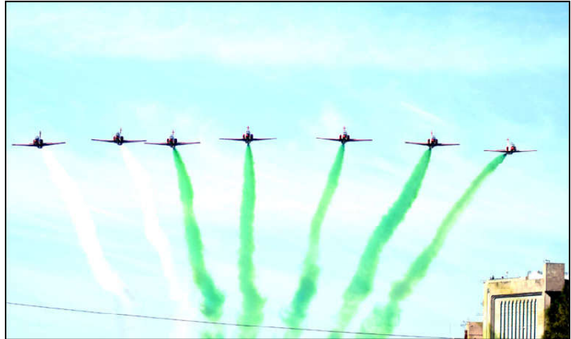
ISLAMABAD: Pakistan Air Force Karakoram-8 (K-8) aircraft team perform aerobatic manoeuvres during the National Day Parade as they fly past in front of President's House, in Federal Capital.

He expressed confidence that the traditional friendship and strategic partnership between Azerbaijan and Pakistan, strengthened by the time-tested brotherhood and unity of our peoples, will continue to grow and deepen through our joint efforts. "On this significant day, I wish you good health, happiness, and success in your endeavors, and the brotherly people of Pakistan everlasting peace, prosperity, and well-being," he added.