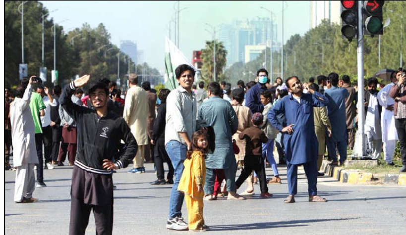
ISLAMABAD: People watch the skill of Pakistan Air Force (PAF)'s jets over the President's House during the Pakistan Day Parade.

This year's event, graced by Chief Minister of Khyber Pakhtunkhwa, Ali Amin Gandapur as the chief guest, was held here at the Islamabad Golf Club. On this occasion, he took the opportunity to personally engage with each distinguished guest and present them with traditional gifts as a token of goodwill. Additionally, Chief Minister Gandapur distributed shillings among nominated participants, acknowledging their efforts in fostering religious harmony and understanding.