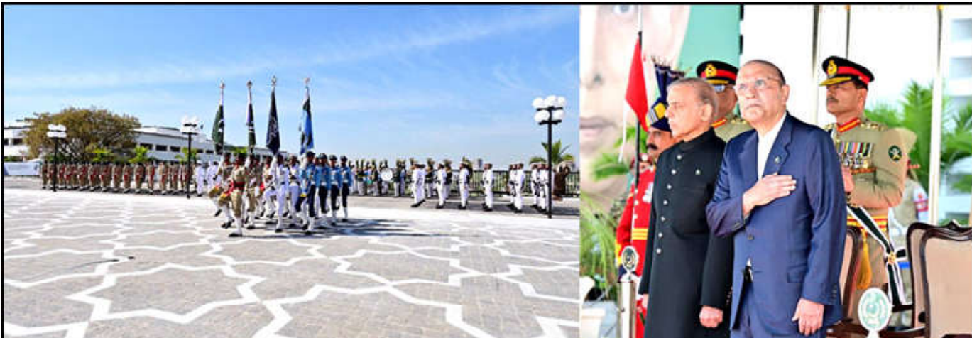
ISLAMABAD: President Asif Ali Zardari and Prime Minister Shehbaz Sharif witnessing the Pakistan Day parade ceremony, at Aiwan-e-Sadr.