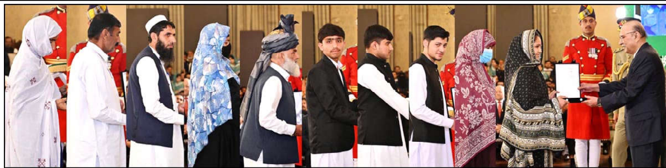
The next-of-kin of the martyrs receiving the awards of Hilal-i-Shuja'at from President Asif Ali Zardari at the investiture ceremony to confer the insignias of civil awards, held at Aiwan-e-Sadr.