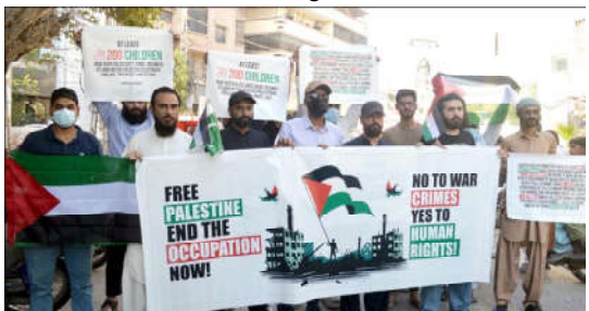
HYDERABAD: Members of Civil Society hold a protest against Israeli aggression in Gaza.