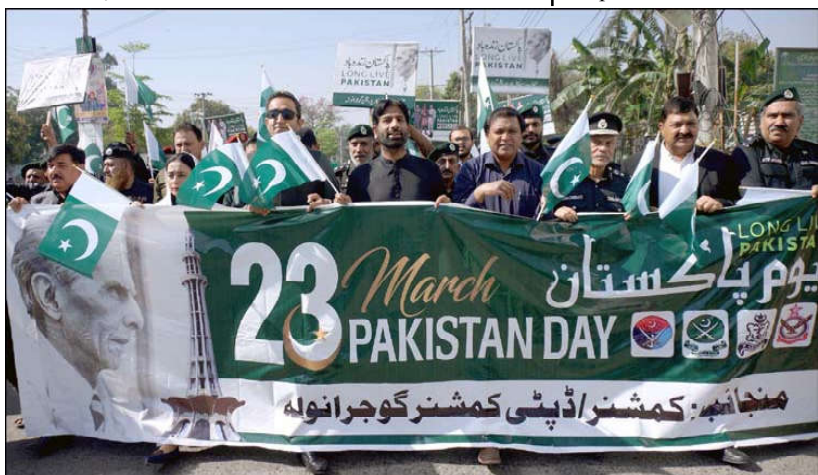
GUJRANWALA: Participants are holding a celebration demonstration on the occasion of Pakistan Resolution Day, organized by District Administration and led by Deputy Commissioner.

The study will further examine the beautification of entry and exit points, roads, chowks, and roundabouts, along with the development of a waterproof canal, outdoor advertising regulations, traffic and transportation improvements, and infrastructure upgrades. Measures to remove encroachments and enhance underpasses and bridges were also discussed.