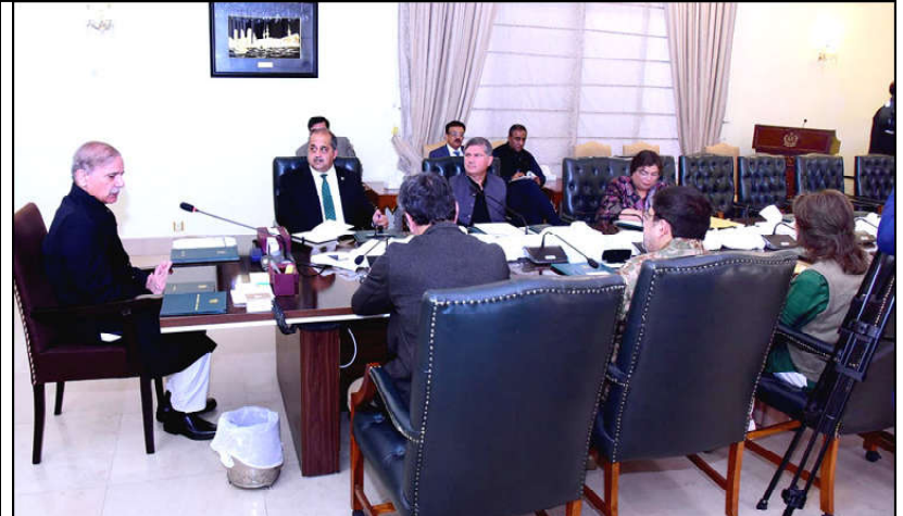
ISLAMABAD: Prime Minister Muhammad Shehbaz Sharif chairs a review meeting on the matters related to Power Division.

He appreciated the contributions of Pakistan's armed forces, industries, education sector, and sportsmen making their mark on the global stage and bringing fame to the country with the parliament, judiciary, and executive also fulfilling their constitutional duties.