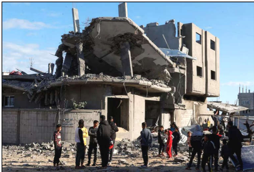
Palestinians gather at the site of an Israeli strike on a house, in Khan Younis in the southern Gaza Strip.

"Visibility in area will be reduced and roads/evacuation routes can become blocked; if you do not leave now, you could be trapped, injured, or killed," a social media post by the agency warned residents of specific roads.