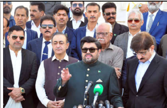
KARACHI: Governor Sindh, Kamran Tessori talking to media persons along with Chief Minister Sindh, Syed Murad Ali Shah after laying floral wreath on the grave of Muhammad Ali Jinnah on the occasion of Pakistan Resolution Day held at Mazar-e-Quaid.