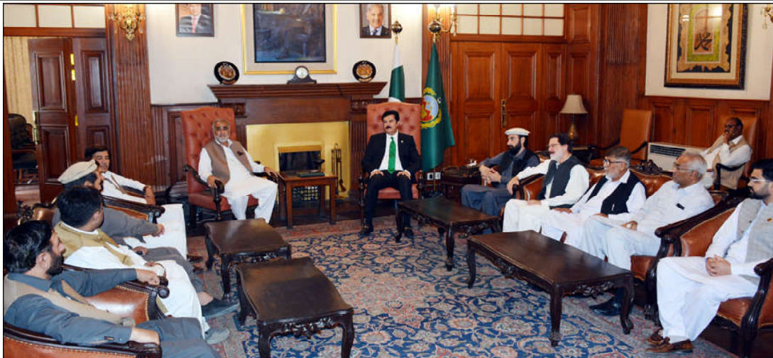
PESHAWAR: Governor Khyber Pakhtunkhwa Faisal Karim Kundi called on by Khyber Chamber of Commerce & Industry Loya Jirga delegation at Governor House.