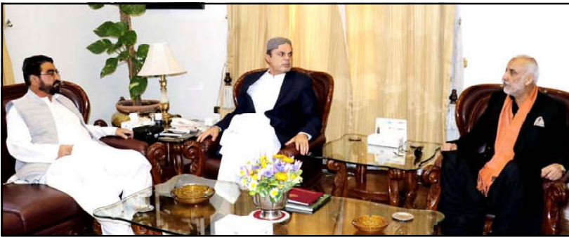
QUETTA: Provincial Ministers Mir Asim Kurd Gallo and Sardar Abdul Rehman Khetran meeting with acting Governor Balochistan Captain (Retd) Abdul Khaliq Achakzai.

Mir Sarfraz Bugti's remarks on Pakistan Day highlight the ongoing commitment of both the government and the people of Balochistan to uphold the values of unity, sacrifice,