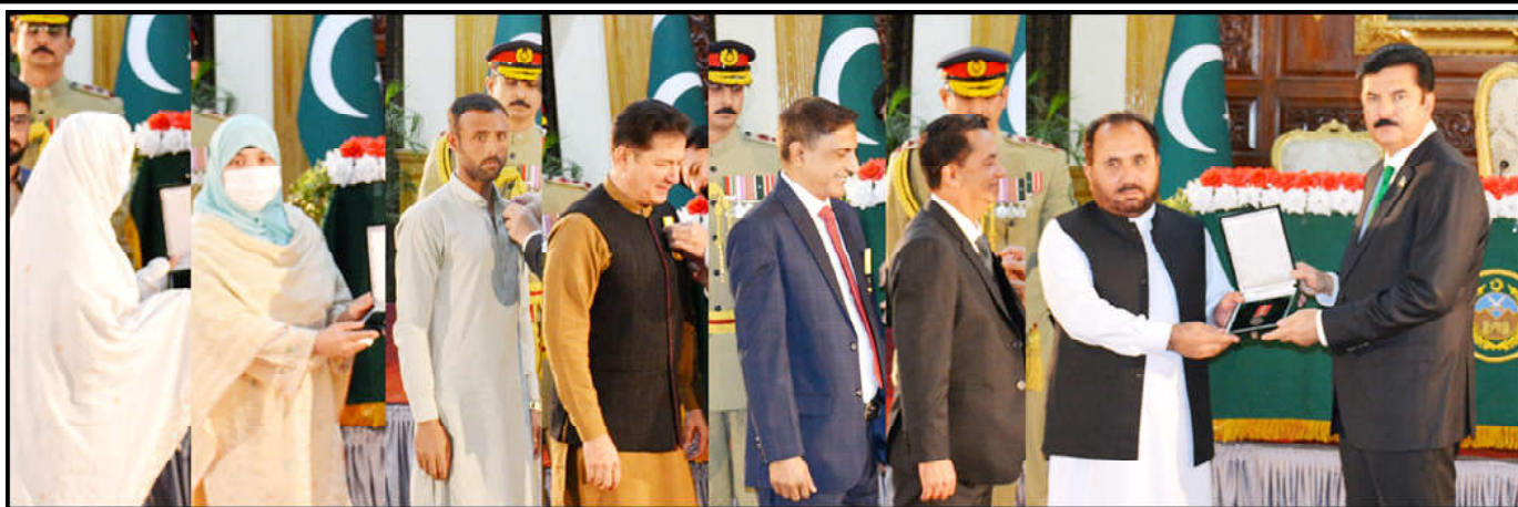
PESHAWAR: Khyber Pakhtunkhwa Governor Faisal Karim Kundi confers Presidential Civil Awards to seven personalities of Kyber Pakhtunkhwa province during a ceremony at Governor House.

Meanwhile, Punjab Chief Minister Maryam Nawaz extended heartfelt congratulations to the nation, paying tribute to the founding leaders and the sacrifices of martyrs.