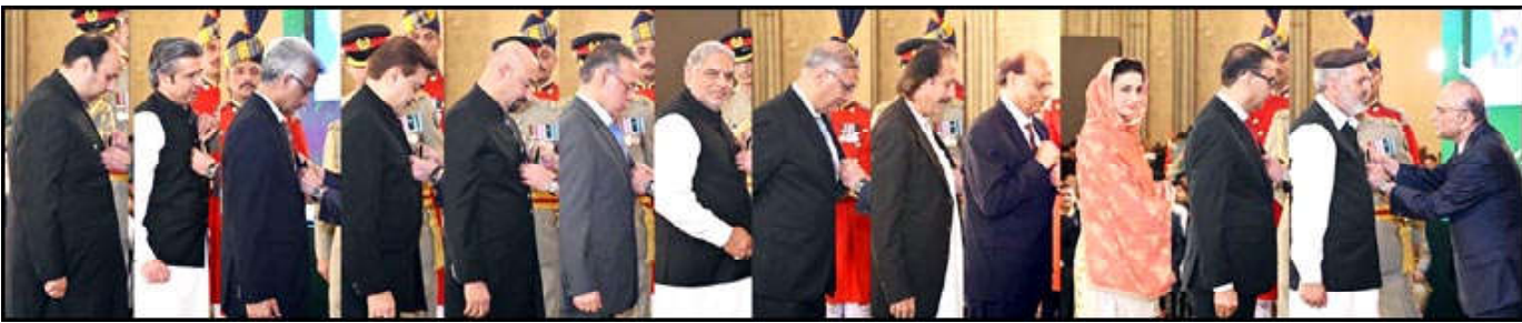
President Asif Ali Zardari conferring the awards of Tamgha-i-Imtiaz during the investiture ceremony to confer the insignias of civil awards, held at Aiwan-e-Sadr.