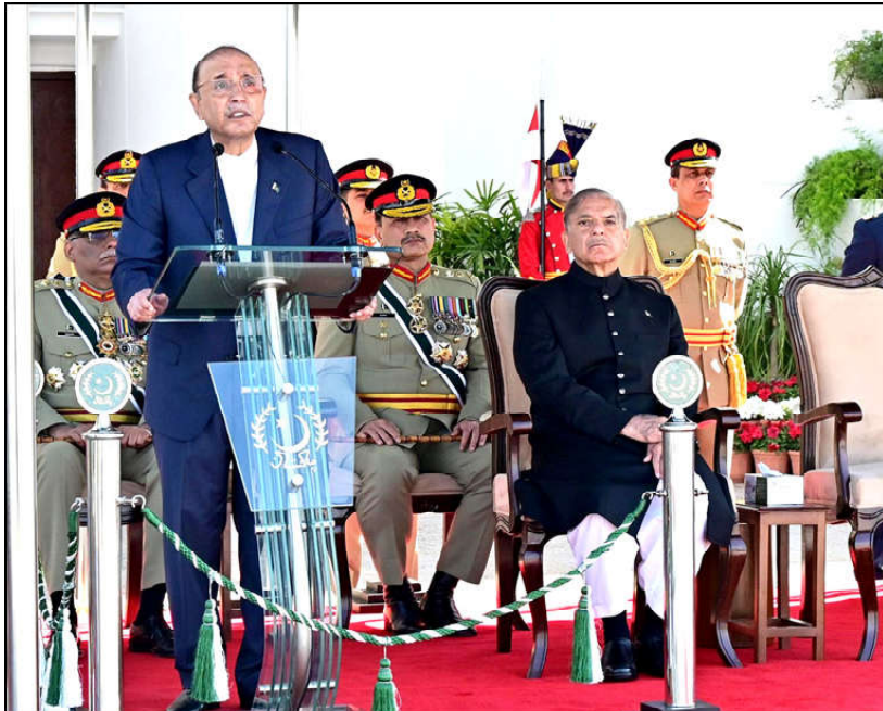
ISLAMABAD: President Asif Ali Zardari addressing the Pakistan Day parade ceremony, at Aiwan-e-Sadr.

Ph: 2841470/2841473 REG: No. BC-116 B/ID-445 Vol XXVI No. 214, Ramzan 23, 1446 AH Monday March 24, 2025 Pages 08, Price Rs.15