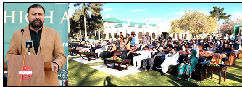
QUETTA: Chief Minister Balochistan Mir Sarfraz Ahmed Bugti addressing ceremony of High Achievement Awards.

He said that the BNP has decided to observe black day against the alleged action against BYC. He also announced that Balochistan conference would be held on the issues of province after Eidul Fitr. He said that different political parties are being contacted regarding Balochistan conference.