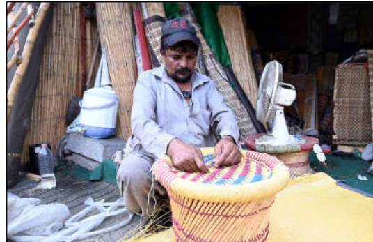
LAHORE: A worker prepares hand-made stools at his workplace.

The renewal requires the payment of the prescribed fee along with a copy of the Income Tax Return for the year 2024.