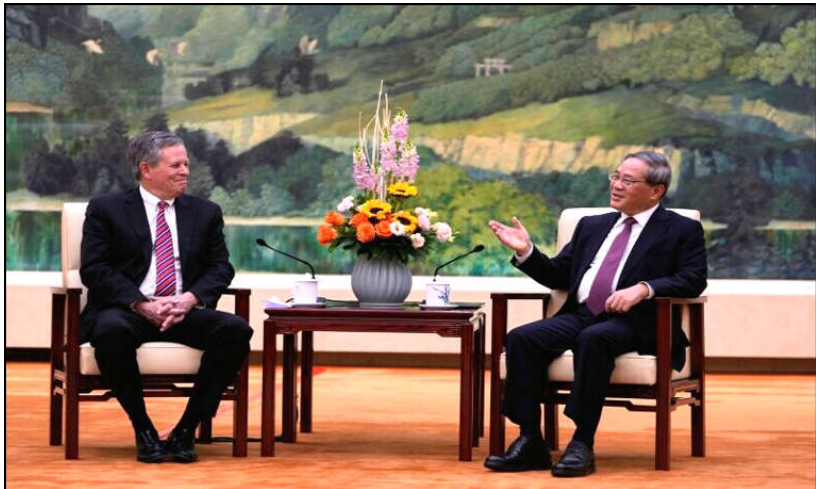
Chinese Premier Li Qiang meets US Senator Steve Daines in the Fujian Room at the Great Hall of the People in Beijing.

Beijing will "adhere to the correct direction of economic globalisation, practice true multilateralism and strive to be a force for stability and certainty", Li said.