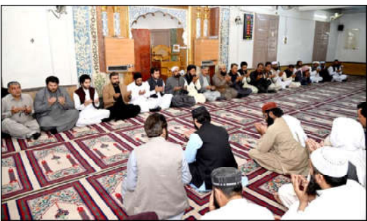
QUETTA: Chief Minister Balochistan Mir Sarfraz Ahmed Bugti offering Fataha on sad demise of senior leader of JUI Hafiz Hussain Ahmed. Provincial Ministers and MPAs are also present.

He extended heartfelt congratulations to the entire nation on Pakistan Day and prayed for the country's continued peace, prosperity, and stability, urging everyone to work diligently for its development.