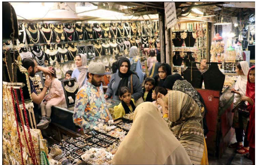
LAHORE: People are busy in Eid shopping ahead of Eid-ul-Fitar during the Holy Month of Ramadan-ul-Mubarak, at Anarkali Bazar in Lahore.

Bank and JazzCash—now Pakistan's leading digital wallet with over 48 million registered users—Aamir has championed the cause of financial inclusion at scale, ensuring that women, youth, and small and medium enterprises (SMEs) have the tools and access they need to thrive in today's economy. By digitizing everyday transactions and enabling participation in the formal financial system, these efforts are powering Pakistan's transition toward a cashless, digitally empowered economy. Beyond access, Aamir has played a key role in addressing Pakistan's industry-academia gap, enabling future generations to gain the digital skills and exposure needed for sustainable economic participation.