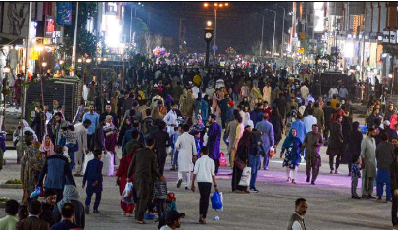
RAWALPINDI: Large numbers of people visiting the Bank Road Sadar as the Eid ul-Fitr shopping start accelerate.