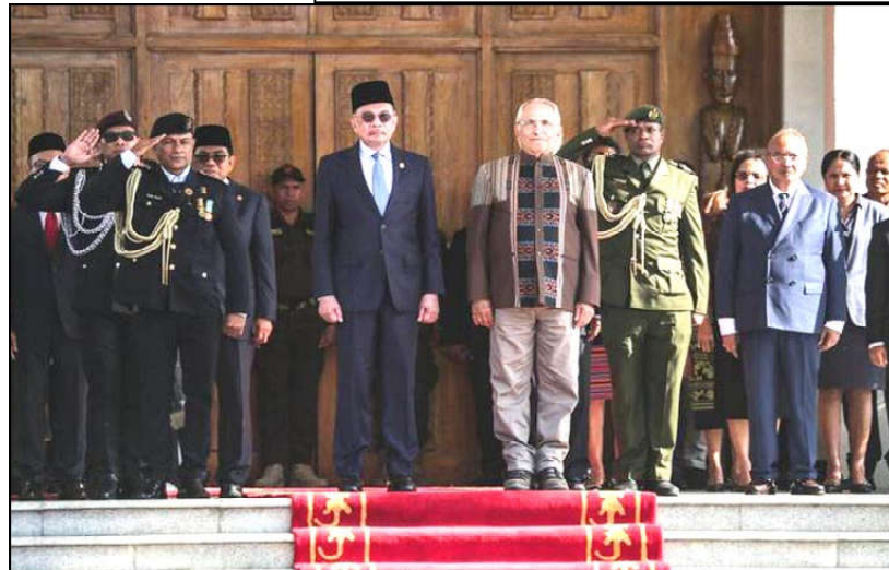
Anwar with and East Timor's President Jose Ramos-Horta at the Presidential Palace in Dili.

The comments came after Israeli newspaper Haaretz cited sources saying Hamas had agreed in principle to release all the Israeli hostages it holds in return for hundreds of Palestinian prisoners and the gradual withdrawal of Israeli troops under Trump's plan. Also included in the proposal were the end of Hamas rule in Gaza, and Israel agreeing not to annex the territory and drive out Palestinians living there, Haaretz reported.