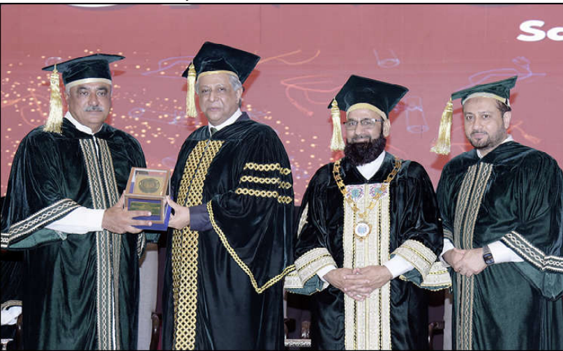
LAHORE: Punjab Minister for Health Khawaja Salman Rafique receiving shield during convocation of CPSP. Federal Minister for Law Azam Nazir Tarar and Provincial Minister Khawaja Imran Nazir are also present.

the Prime Minister of the country with a public mandate in the upcoming elections. He said that the way the party workers welcomed me on my arrival in Gujarat is indescribable. The Governor Punjab said that such a big rally of the PPP held in Lahore yesterday has disturbed other parties. He said that the PPP has been restored in Lahore. The Punjab Governor said that the PPP will give a surprise in the next election. He said that I will go from street to street in the entire Punjab as a party leader. The Punjab Governor said that if there is any trouble with any PPP worker, I will leave my entire busy schedule and reach the worker. He further said that the PPP will soon hold a big rally in Gujarat as well.