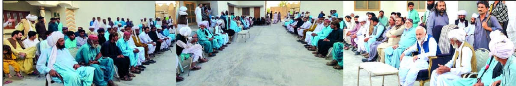
BARKHAN: Provincial Minister for PHE Sardar Abdul Rehman Khetran talking to delegation from different walk of life.