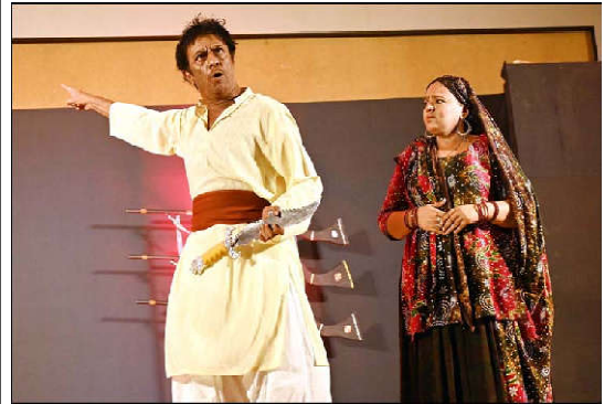
HYDERABAD: Local artists performing drama on the stage during theater festival 2025 organized by Art council of Pakistan at Sindh museum.

She further stated that the vision of PML-N leader Nawaz Sharif, the tireless efforts of Prime Minister (PM) Shahbaz Sharif and the public-friendly initiatives of Punjab Chief Minister (CM) Maryam Nawaz have ushered Pakistan into a new era of growth and prosperity.