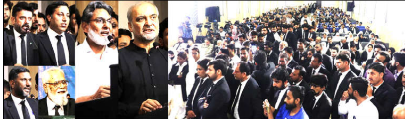
KARACHI: Jamaat-e-Islami Emir Hafiz Naeem ur Rehman addresses seminar at Jinnah Auditorium City Court.