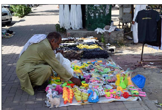
ISLAMABAD: A vendor arranging and displaying children's plastic toys on the footpath to attract customers in the Federal Capital.

According to sources, practical work on the project would begin in the coming weeks, enabling citizens soon to travel in modern, comfortable, and eco-friendly electric buses.