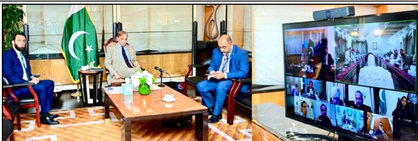
NEW YORK: Prime Minister Muhammad Shehbaz Sharif chairs a meeting to review damages and relief operations in the wake of recent floods.