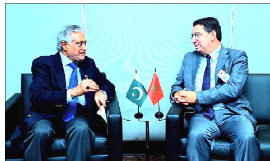
NEW YORK: Deputy Prime Minister and Foreign Minister, Senator Mohammad Ishaq Dar met with Foreign Minister of Morocco, Nasser Bourita, on the sidelines of 80th UNGA session, in New York.

Sources said the IMF delegation was also briefed on the government's comprehensive roadmap to stabilise the sector. This included measures to address inefficiencies and prevent any future accumulation of debt. The government highlighted that critical steps such as tariff restructuring and controlled subsidies were part of the strategy to strengthen financial sustainability.