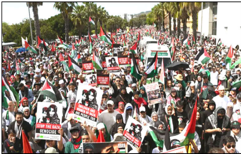
Protesters hold placards and Palestinian flags as they march through the city centre during civil society and faith-based organisations' mass rally for Gaza, in Cape Town.