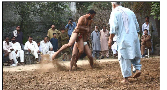
RAWALPINDI: Athletes wrestle during trials for the Rustam Rawalpindi competitions in November at Liaquat Bagh Akhara Dada Pehlwan Rustam Rawalpindi.

Alongside, a strict crackdown is underway against the burning of crop residues, while measures are being taken to regulate vehicular emissions and industrial fumes. She stressed that citizens also have a responsibility to play their role in controlling environmental pollution, urging people to avoid unnecessary outdoor movement during smog season. Special caution, she said, must be observed by children, elderly persons, and patients with respiratory conditions.