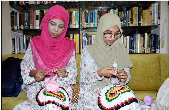
LAHORE: Girls engaged in crochet and karhai knitting during the Croatian Workshop on Ancient Croatian Art in Pakistan, organized by The Knowledge of Art Academy.