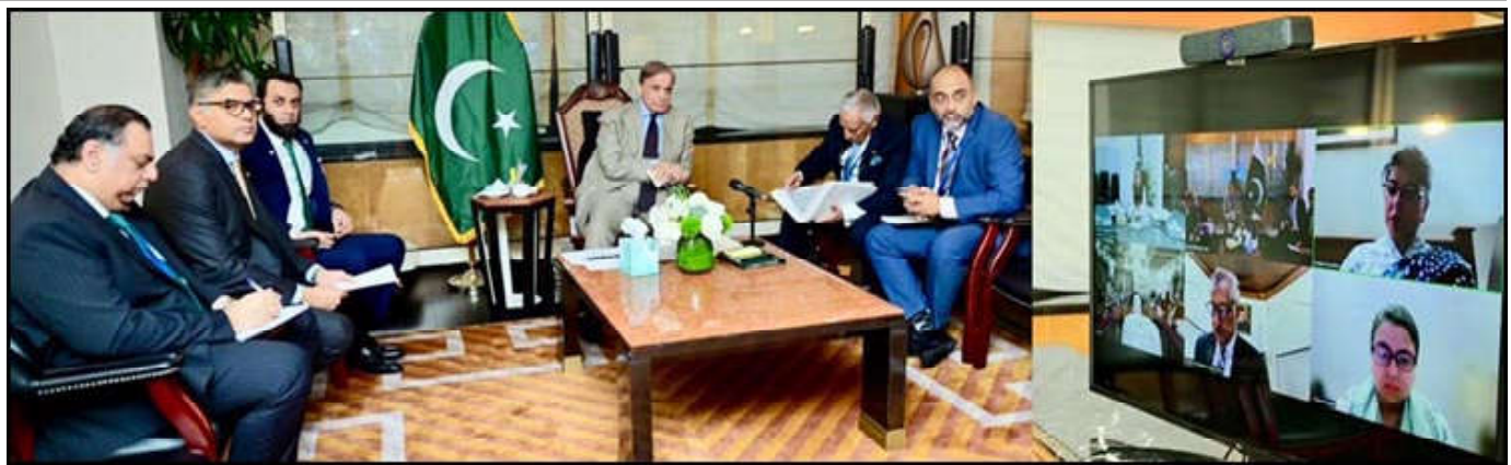
NEW YORK: Prime Minister Muhammad Shehbaz Sharif chairs a meeting regarding Pakistan's bilateral trade with Malaysia.

But the region's official oil exports have been frozen since March 2023 when the arbitration tribunal of the International Chamber of Commerce in Paris ruled oil exports by the regional government were illegal and said Baghdad had the exclusive right to market all Iraqi oil.