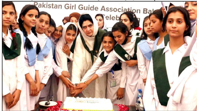
QUETTA: Provincial Minister for Education Raheela Hameed Khan Durrani cutting the cake on the eve of Girls Guide Association annual ceremony.

These back-to-back tragedies have once again spotlighted the critical issue of road safety in Balochistan, where reckless driving and poor infrastructure continue to pose serious risks to public safety.