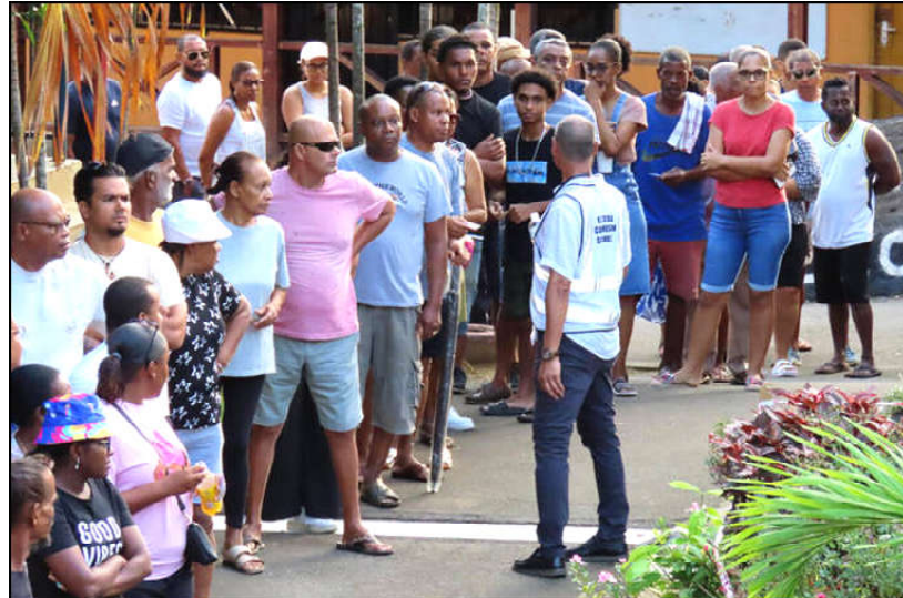
People line up to cast their votes at Beau Vallon Secondary School in Beau Vallon, Seychelles.

Earlier on Friday, they had filed a request to the court to annul the result. The request was rejected. The court's confirmation paves the way for elections to be held in December. The signs suggest that Doumbouya will run for the presidency.