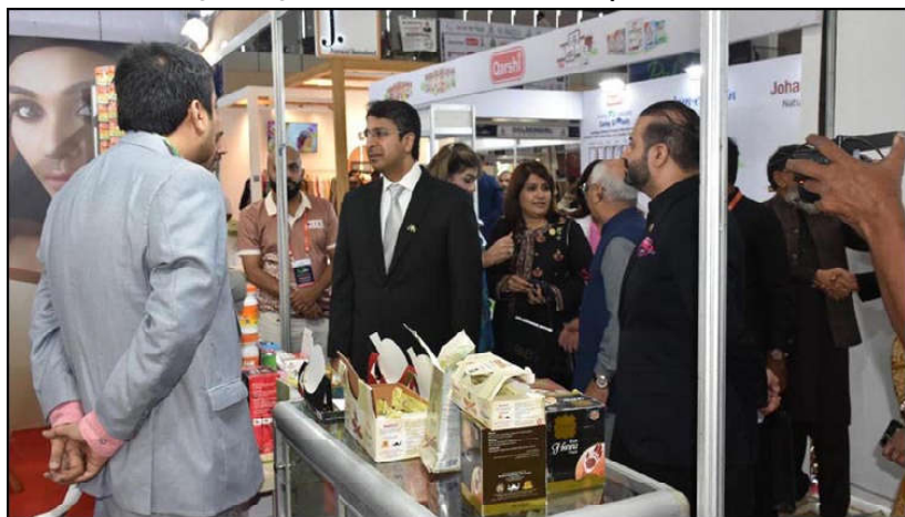
DHAKA: Coordinator to the Prime Minister on Commerce Ishaan Afzal Khan, visiting stalls at the 'Made in Pakistan' Exhibition in Dhaka and appreciating Pakistani exhibitors for showcasing their products.

The ambassador underlined food as a bridge for cultural diplomacy, drawing parallels between the ancient Silk Road and today's exchanges, and noted that the initiative complements Pakistan's broader economic engagement with China, particularly in agriculture, food processing, and trade.