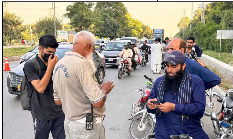
ISLAMABAD: Traffic police issue chalan ticket to motorcyclist for helmet violation in capital city.