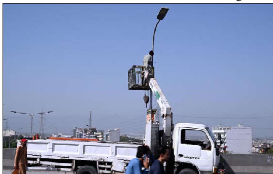
ISLAMABAD: A worker is busy repairing a street light at Khanna Pul area in the Federal Capital.

The spokesperson condemned the curfew, restrictions and continuous internet shutdown in Leh and Kargil areas of Ladakh region and demanded the immediate release of all arrested persons, including renowned environmental activist Sonam Wangchuck.