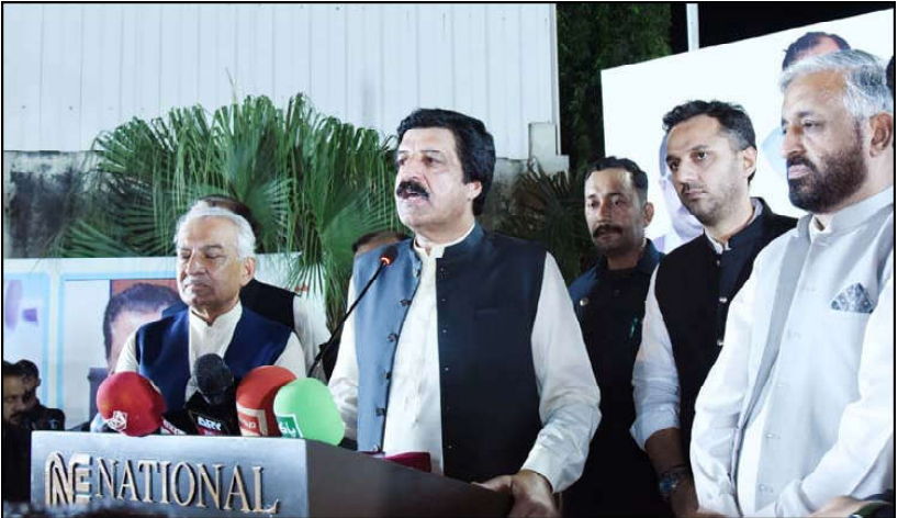
GUJRAT: Punjab Governor Sardar Saleem Haider Khan is addressing to the Party workers and Mughal Community.

The CM said that 20,000 kilometers of roads had been constructed and repaired across Punjab under the Punjab Development Programme and Lahore Development Plan. She announced that anti-smog guns would be deployed to combat environmental hazards, while wildlife rangers had been established in the province for the first time. She added that urban beautification and restoration of tourism sites were also underway.