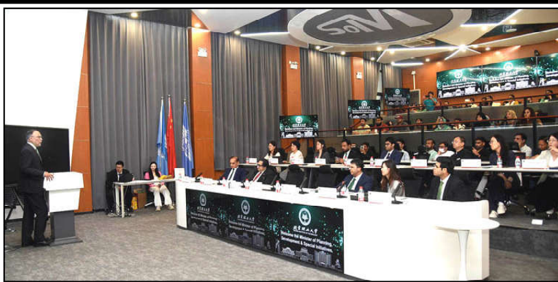
BEIJING: Federal Minister for Planning, Development and Special Initiatives, Professor Ahsan Iqbal, addressing the management and students during his visit to Beijing Institute of Technology.

This unified resolve among tribes, elders, and civil and military leadership is a joint declaration that terrorism and extortion will be completely eradicated, framing this combined effort as a crucial "war for peace and prosperity."