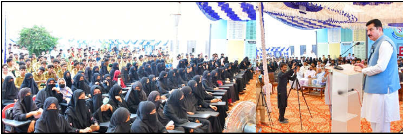
DERA ISLAMIL KHAN: Governor Khyber Pakhtunkhwa Faisal Karim Kundi addressing as Chief Guest to annual awards ceremony of the Al-Abbas Science School & College.