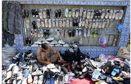
LARKANA: A vendor displaying and arranging old footwear to attract customers at his roadside setup.

The prime minister was given a comprehensive briefing on Pakistan's export potential in the Malaysian market. He directed that a solid action plan should be developed and presented, focusing on enhancing trade between Pakistan and Malaysia, particularly the export of Pakistani beef to Malaysia.