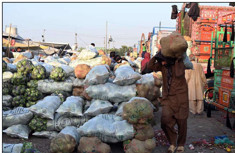
ISLAMABAD: A worker busy offloading cabbage sacks from a delivery truck at the Fruit and Vegetable Market in the Federal Capital.

"Tourism must not only serve as an engine of economic growth but also as a tool for safeguarding our environment and protecting our cultural legacy.