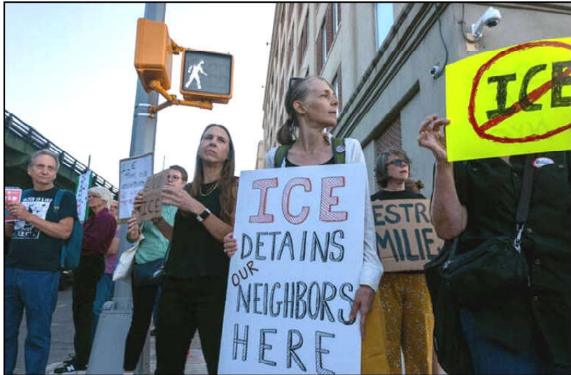
Dozens of people participate in an anti-Immigration and Customs Enforcement (ICE) rally outside of the Brooklyn Metropolitan Detention Center.