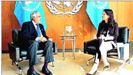
NEW YORK: Deputy Prime Minister and Foreign Minister, Senator Mohammad Ishaq Dar met with President of the UN General Assembly, Annalena Baerbock on sidelines of 80th UNGA session.

During his visit, the Governor visited various sections of the center and engaged with students, posing questions and encouraging dialogue. He emphasized the dual responsibility of educators—not only to impart modern knowledge but also to nurture character and moral values among students.