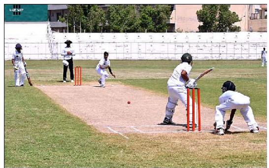
HYDERABAD: Players in action during a cricket match between Govt. Ghulam Hussain Boys High School and The Spark School teams as part of the Inter-School PCB Talent Hunt Program at Niaz Cricket Stadium.

Financial tracing exposed that operation was funded through a mix of traditional and modern transfer methods. Millions of rupees were channeled to terrorists using local services like Easypaisa and illicit hawala system.