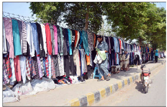
MULTAN: Vendor displaying clothes to attract customer at BC chowk.

In a ceremony presided over by the Minister, all 11 Chinese institutions were presented with membership plaques of the Pakistan-China International Industrial-Academic Integration Alliance (CPIA). Additionally, appointment letters were issued to the first batch of 8 Chinese experts specializing in strategic sectors such as pharmaceutical engineering, digital construction, automotive, and agricultural engineering.