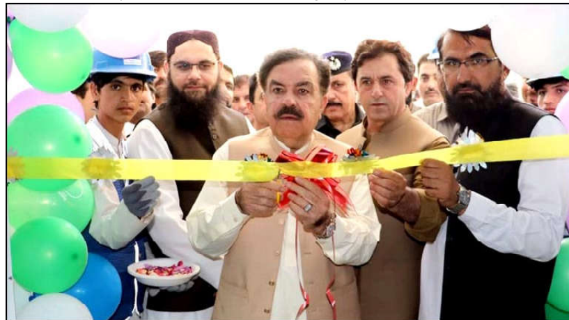
ZHOB: Balochistan Governor Jaffar Khan Mandokhel inaugurates Skills Education Centre in collaboration with UNICEF and European Union at Model Higher School Zhob.