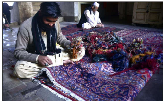
PESHAWAR: Workers busy in making carpets on his workplace at Khyber bazaar.

Experts underline that while the current trade growth is encouraging, Pakistan's real opportunity lies in establishing direct connectivity and strategic trade routes with the Central Asian bloc.