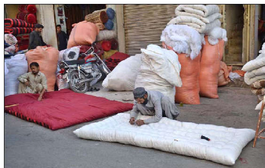
QUETTA: A worker diligently crafts a traditional quilt in preparation for the approaching cold season.

The meeting was attended by the additional chief secretary, chairman planning and development board, and all administrative secretaries.