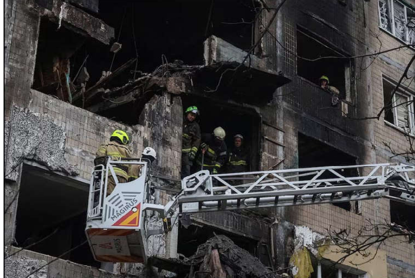
Firefighters work at the site of an apartment building damaged during a Russian drone and missile strike, amid Russia's attack on Ukraine, in Kyiv, Ukraine.