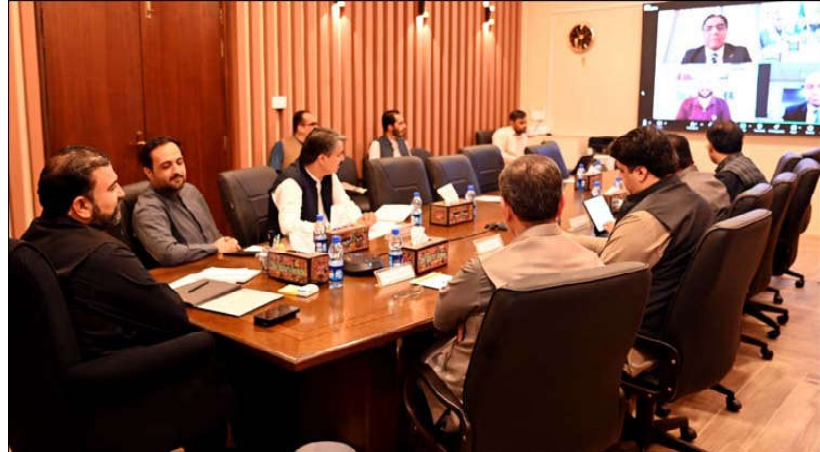
QUETTA: Balochistan Chief Minister Mir Sarfaraz Bugti presides over the meeting regarding Chief Minister Youth Skills Development Program.