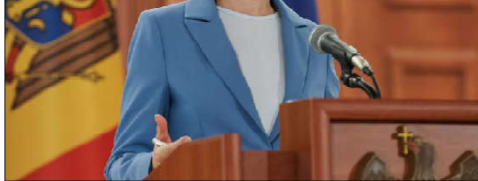
Moldovan President Maia Sandu attends a press conference following the announcement of parliamentary elections results, in Chisinau, Moldova.

It was not immediately clear if the reported attack was carried out by Yemen's Iran-aligned Houthis, who had launched numerous attacks on vessels in the Red Sea since 2023 that they deem to be linked with Israel in what they say is solidarity with Palestinians in Israel's war on Gaza.