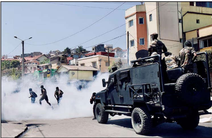
Malagasy riot police use tear gas to disperse protesters during a demonstration against frequent power outages and water shortages, near the University of Antananarivo, Madagascar.

Reuters was unable to confirm the reason for the drone flights.