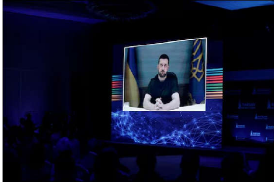
Ukraine's President Volodymyr Zelenskiy appears on-screen as he speaks during the Warsaw Security Forum, in Warsaw, Poland.

German Defence Minister Boris Pistorius told the conference that "Europe's and Ukraine's defence industry must work together more closely and effectively". "The European Union must back this by providing a much more flexible regulatory framework for the defence industry in Europe."