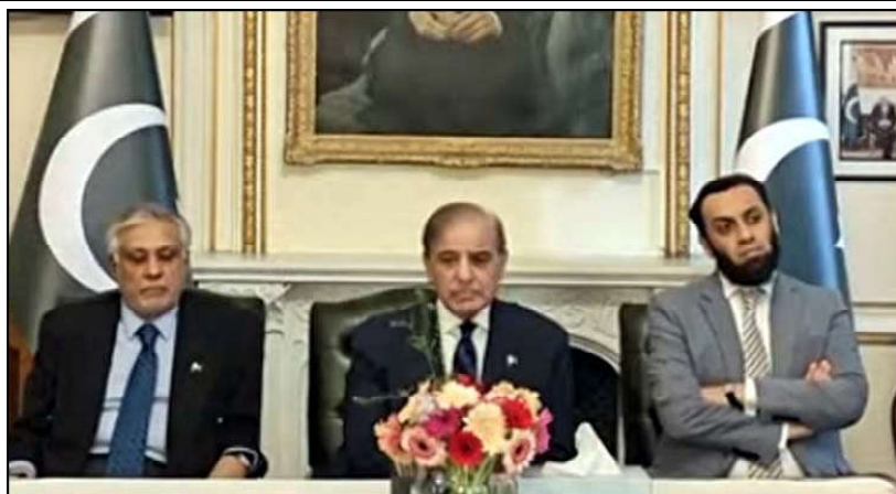
LONDON: Prime Minister Muhammad Shehbaz Sharif flanked by Deputy Prime Minister and Foreign Minister Ishaq Dar and Information Minister Attaullah Tarar, addressing a Press Conference.