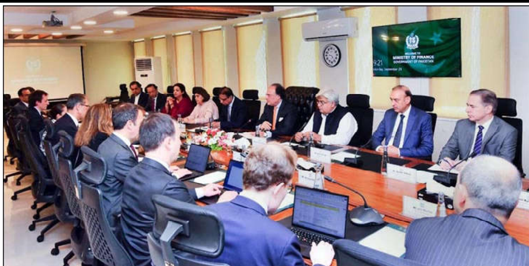
ISLAMABAD: Federal Minister for Finance and Revenue, Senator Muhammad Aurangzeb chairing the kick-off meeting with the visiting IMF Review Mission at the Finance Division.