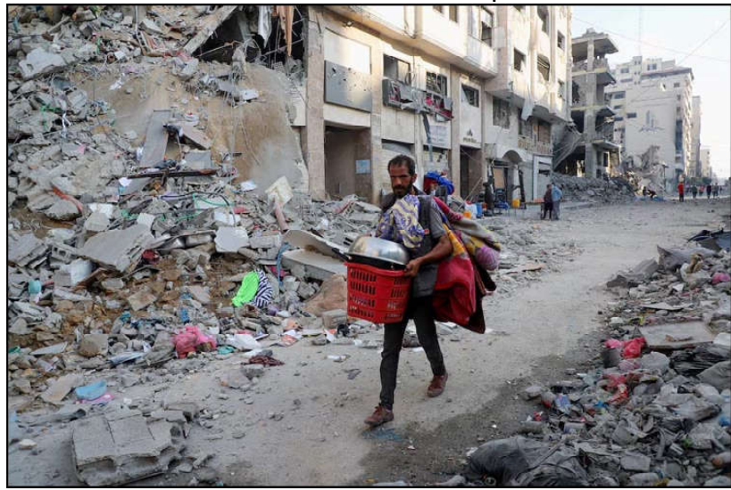
A Palestinian man carries his belongings during an Israeli military operation, after residents were ordered to evacuate Gaza City.

Leavitt, speaking on Fox News' "Fox and Friends" program, said President Donald Trump would discuss a 21-point peace plan with Israeli Prime Minister Benjamin Netanyahu at the White House later on Monday. Trump will speak to leaders in Qatar, who have served as intermediaries with Hamas, on Monday, she said.