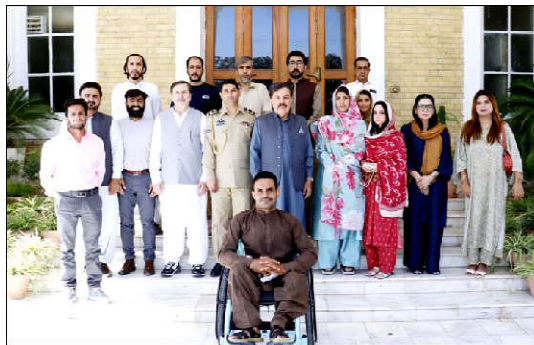
QUETTA: Balochistan Governor Jaffar Khan Mandokhel in a group photo with delegation of Individual Land.

To reinforce oversight, CM Sarfraz Bugti instructed CMIT to conduct regular field inspections of all PSDP schemes. In a symbolic move, he directed the team to begin its inspections from his own constituency, Bakkar, demonstrating personal accountability and leadership by example.