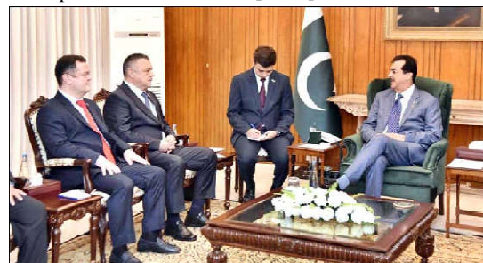
ISLAMABAD: Delegation headed by H.E. Mr. Nuriddin Ismoilov, Speaker of the Oliy Majlis of the Republic of Uzbekistan, calls on the Acting President, Syed Yousuf Raza Gilani at Aiwan-e-Sadr.

"Working with the new transitional authority in Gaza, all parties will agree on a timeline for Israeli forces to withdraw in phases," Trump told reporters at the White House, referring to a new body that would govern the Palestinian territory. US President Donald Trump was upbeat about the chances of a Gaza deal Monday as he hosted Benjamin Netanyahu at the White House to push the Israeli prime minister to accept his peace plan.