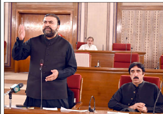
QUETTA: Balochistan Chief Minister Mir Sarfaraz Bugti expressing his views during Balochistan Assembly session.

Punjab Minister for Irrigation Kazim Ali Pirzada informed that all breaches on the Motorway will be closed by the evening of October 4 after which a team of experts will carry out a technical review on October 6.