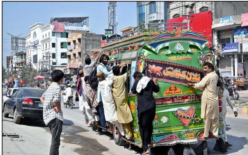
ISLAMABAD: People travelling on a passenger bus in a risky way at Lehtrar Road may cause any mishap and needs the attention of concerned authorities.

In a condolence message, the minister extended his heartfelt sympathy and condolences to the family of the deceased.