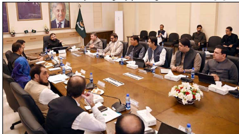
QUETTA: Balochistan Chief Minister Mir Sarfraz Bugti, chairs high-level meeting at the Chief Minister's Secretariat focused on the implementation of the Public Sector Development Program (PSDP).