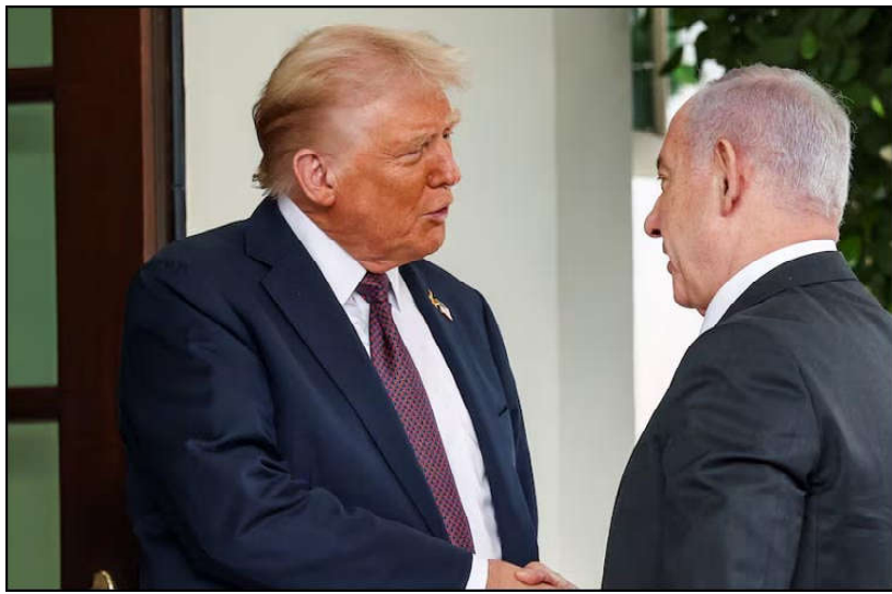
U.S. President Donald Trump shakes hands with Israeli Prime Minister Benjamin Netanyahu at the White House in Washington, D.C., U.S.

Germany will deploy around 40 soldiers to Copenhagen to help with detecting, identifying and defending against drones, a Berlin government spokesperson told reporters in a briefing on the EU summit on Monday. The operation will last until October 7 and the soldiers will carry the appropriate equipment with them, the spokesperson said.