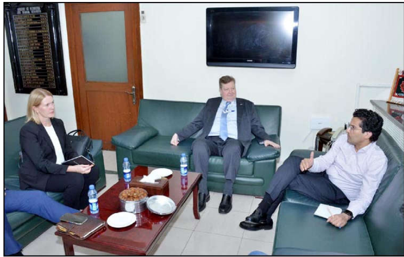
Federal Minister for Petroleum, Ali Pervaiz Malik held a meeting with the Finnish delegation in Islamabad.

The session concluded with an interactive question-and-answer segment, during which the Acting President reiterated the importance of transparent and effective governance.