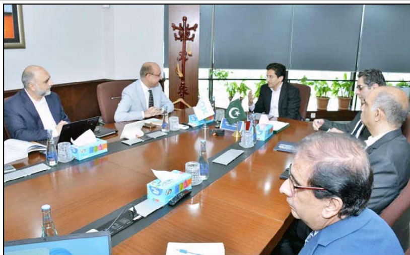
ISLAMABAD: Federal Minister for Petroleum Ali Pervaiz Malik held a meeting with the Managing Director and senior executives of the Oil and Gas Development Company (OGDC) at company's head office.

of expanding access to Islamic banking across the country and advancing our overarching mission of Saving Humanity from Riba.