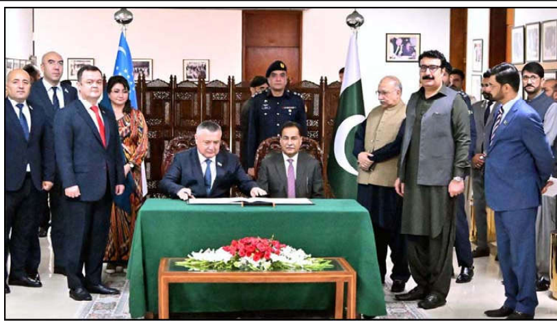
ISLAMABAD: Speaker of the Legislative Chamber of the Oliy Majlis of Uzbekistan, Nuriddin Ismoilov, writing his remarks in the visitors book at Parliament House.