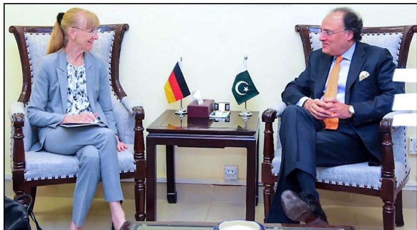
ISLAMABAD: Ina Lepel, Ambassador of the Federal Republic of Germany to Pakistan, called on the Federal Minister for Finance and Revenue, Senator Muhammad Aurangzeb, at the Finance Division.

Both sides reaffirmed their commitment to strengthening Pakistan-Germany economic cooperation and to exploring new opportunities for trade, investment, and development partnership.