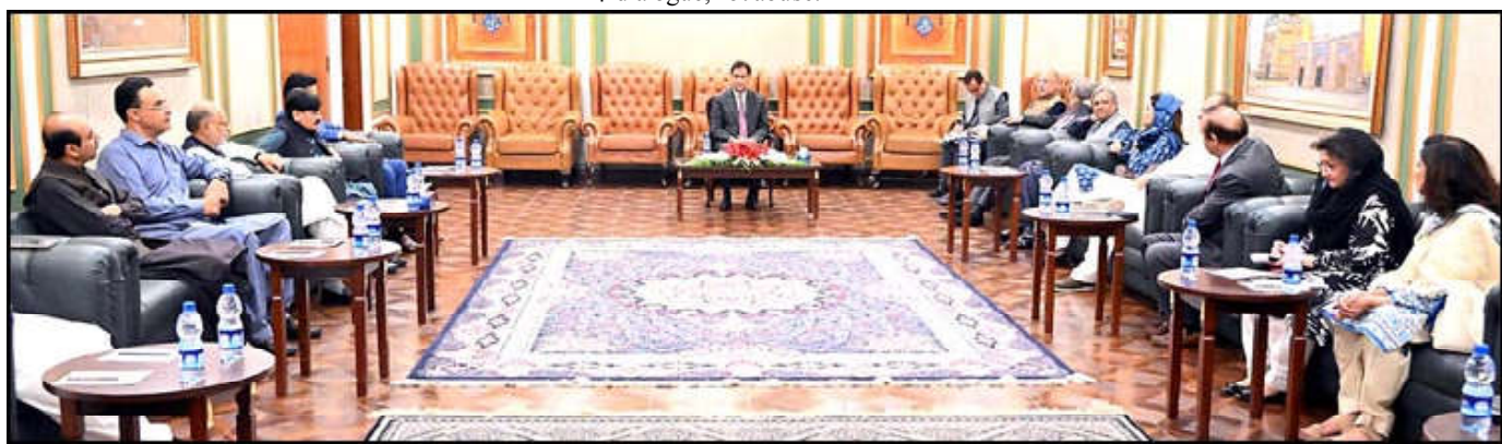
ISLAMABAD: Speaker National Assembly Sardar Ayaz Sadiq chairing at the meeting of Business Advisory Committee at Parliament House.

She acknowledged that the HPV vaccine is expensive but emphasized that initially it is being provided free of cost to encourage maximum participation and remove financial barriers. Dr. Azra Fazal Pechuho also urged parents and guardians to prioritize their children's health by getting them vaccinated and to disregard false information circulating on social media. She stressed the importance of collective responsibility in combating cervical cancer and assured that the government is fully committed to supporting these life-saving efforts.