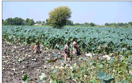
LARKANA: Farmers busy in collecting traditional vegetable beeh at a farm field near Wada Mahar Village.