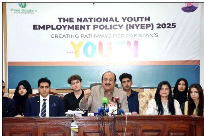
LAHORE: Chairman Prime Minister's Youth Programme Rana Mashhood Ahmad Khan addressing a press conference at Awan e Iqbal.

The minister further stated that the PML-N believed in providing dignified employment, not forcing people to stand in lines for Rs 5,000 or Rs 10,000 handouts.