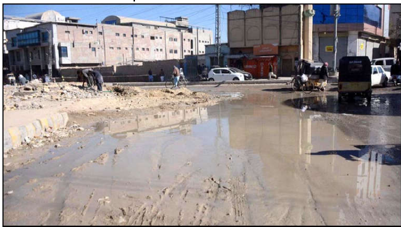
QUETTA: A view of accumulated sewerage water on Double Road.

Notably, both parties had maintained their positions for the past five years, and the matter remained unresolved despite legal proceedings. However, the proactive and effective strategy of Deputy Commissioner Naqeebullah Kakar successfully brought the dispute to a smooth and amicable conclusion.