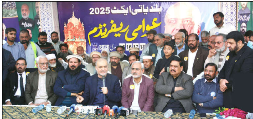
Jamaat-e-Islami Pakistan Emir Hafiz Naeem ur Rehman addressing press conference in Faisalabad.

Following the incident, local police cordoned off the area to secure the scene.