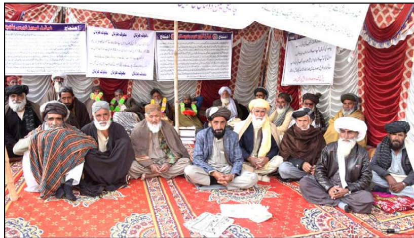
QUETTA: Retired Employees of Federal Levies sitting in protest camp in favour of their demands.