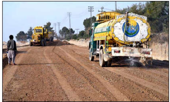
ISLAMABAD: A view of construction work of 10th avenue under process in the Federal Capital.

The meeting concluded with a commitment to explore future cooperation and partnerships aimed at strengthening youth sports development and creating sustainable pathways for young talent through football.