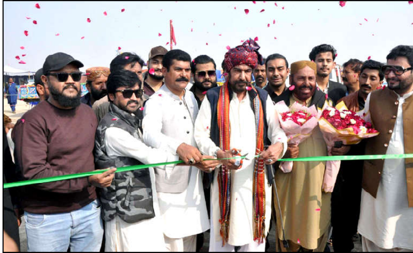
Sardar Muhammad Khan Junejo inaugurates Horse Race competition organized by Sports and Youth Affairs Department of the Sindh Government in Hyderabad.

Activities are going on but horse racing is being organized for the first time in the history of the city.