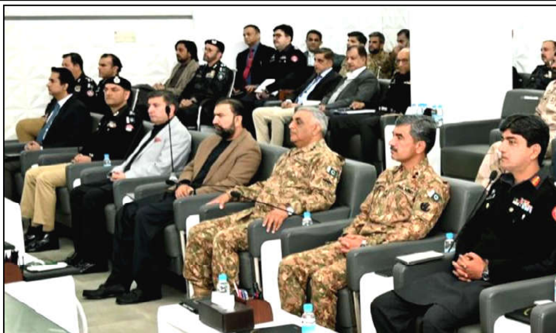
QUETTA: Balochistan Chief Minister Mir Sarfaraz Bugti Corps Commander Balochistan Lieutenant General Rahat Naseem Ahmed Khan co-chair 21st session of the State Defense Conference (Hardening of the State Conference). Balochistan Chief Secretary Shakeel Qadir Khan & other high ups are also present.