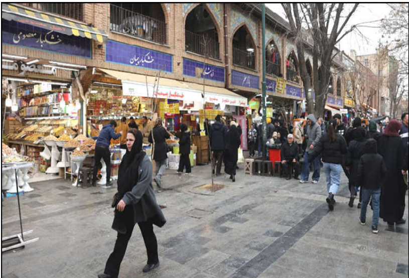
People walk in Tehran Grand Bazaar in Tehran, Iran.

Myanmar is defending itself from accusations brought by The Gambia.