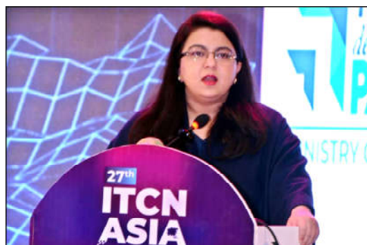
LAHORE: Federal Minister for Information, Technology and Telecommunication Ms. Shaza Fatima Khawaja addressing the 27th ITCN Asia at Expo Center.

He said the continued focus on maintenance underscores Pakistan Railways' commitment to improving passenger comfort and operational resilience, particularly for long-distance and air-conditioned services that rely heavily on dependable power supply.