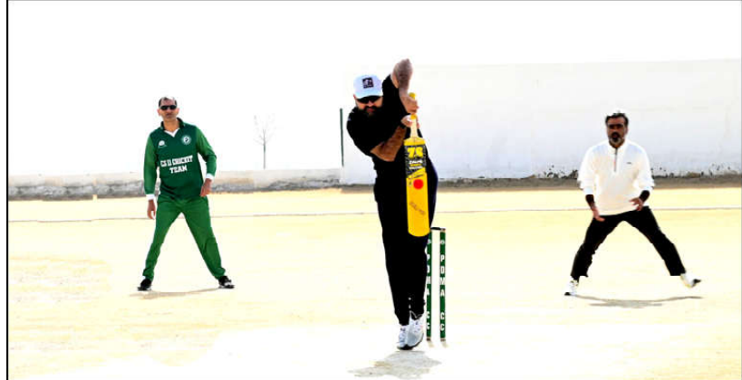
QUETTA: Balochistan Chief Minister Mir Sarfraz Bugti showing outstanding batting performance during match between Chief Minister Eleven and Chief Secretary Eleven.

In addition, the Federal Minister attended the FMF Ministerial Roundtable titled "Dawn of a Global Cause: Minerals for a New Era of Development," which brought together representatives from 100 governments