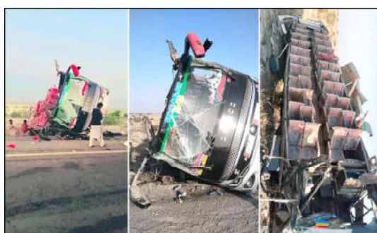
At least 14 people died when a speeding passenger coach overturned on the Makran Coastal Highway at Hudd Goth near Gwadar's Ormara tehsil.