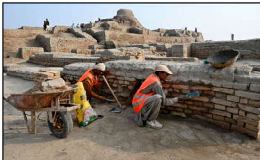
LARKANA: Labourers busy repairing the walls of the world-famous archaeological site of Mohenjo-daro.

According to SP Investigation East SP Usman Sadozai, the arrests were made after a child identified the suspects during a targeted operation by a special investigation team. Imran had a puncture repair stall in the Mehmoodabad area and is a resident of Manzoor Colony. Police revealed that between 2020 and 2025, seven cases of child sexual abuse were reported to police across four districts of Karachi including Malir, Korangi, East and South