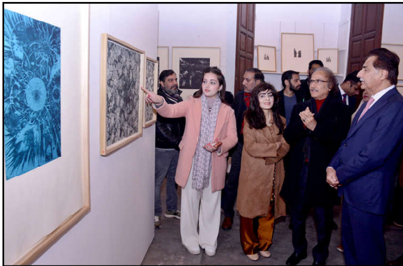
LAHORE: Speaker National Assembly, Sardar Ayaz Sadiq viewing the displayed art stuff during exhibition of Degree Show at NCA.

Rana Mashhood said that the Prime Minister's Youth Programme would continue to serve as a major platform for empowering young people and ensuring their active participation in nation-building.