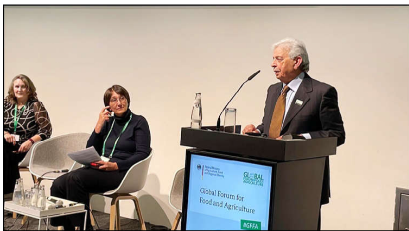
BERLIN: Federal Minister for National Food Security and Research, Rana Tanveer Hussain, addressing the Global Forum for Food and Agriculture (GFFA) 2026 in Berlin, highlighting Pakistan's commitment to water resilience, sustainable agriculture, and food security.

He also pointed out that delays in exporters' refunds had further aggravated the situation.