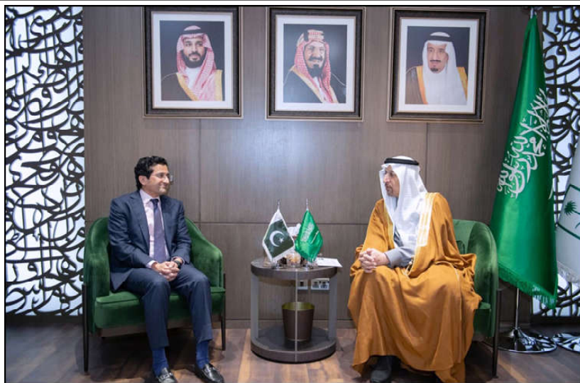
RIYADH: Federal Minister for Petroleum Ali Pervaiz Malik in meeting with Engr. Khalid Al-Falih, Minister of Investment of Saudi Arabia.