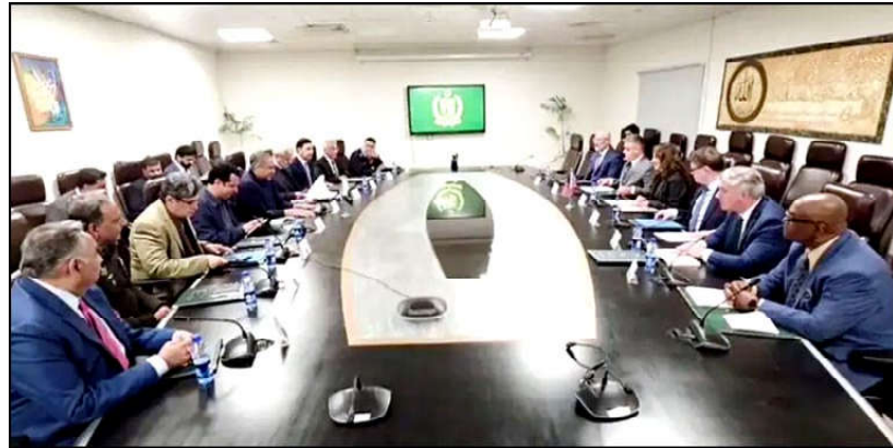
A high-level U.S. delegation led by Chargé d'Affaires Natalie Baker meeting with Interior Minister Mohsin Naqvi in Islamabad.