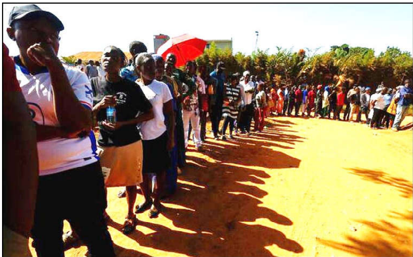
People queue to vote during the general election, at a polling centre within Magere neighborhood in Kasangati town near Kampala, Uganda.

Farhad N., who was 24 at the time, is accused of deliberately steering his BMW Mini into a 1,400-strong trade union street rally in Munich on February 13.