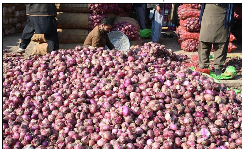
ISLAMABAD: A Laborer busy sorting good quality onions at vegetables Market in Federal Capital.

A subsidy of Rs.600,000/- per laser unit would be provided to the farmers, he added. He said that the eligible farmers and service providers should submit their applications along with relevant documents in the office of Deputy Director Agriculture (Water Management) by January 26, 2026.