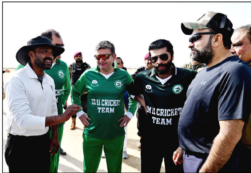
QUETTA: Balochistan Chief Minister Mir Sarfraz Bugti during a toss of match between Chief Minister Eleven and Chief Secretary Eleven.

They pointed out that countries have already adopted effective legislation and it is now time for Pakistan to follow suit.