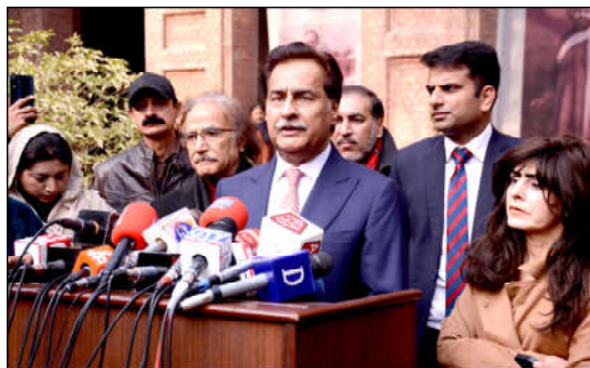
LAHORE: Speaker National Assembly, Sardar Ayaz Sadiq talking to media persons after viewing the displayed art stuff during exhibition of Degree Show at NCA.