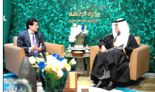
Riyadh: Federal Minister for Petroleum Ali Pervaiz Malik in meeting with HRH Prince Abdulaziz bin Salman Al-Saud, Minister of Energy of Saudi Arabia.

In a statement issued on Saturday, the Turkish presidency said it had received a formal letter from President Trump inviting President Erdogan to become part of the initiative.