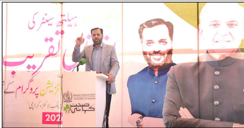
KARACHI: Federal Minister for National Health Services, Regulation and Coordination Syed Mustafa Kamal addressing the inauguration ceremony of 'Digitalized Healthcare Centre'.