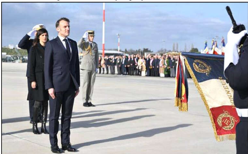
French President Emmanuel Macron reviews troops as he visits the Istres military air force base, southern France.

Hamas, meanwhile, has refused to publicly commit to a full disarmament, a non-negotiable demand from Israel.