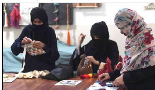
KARACHI: Woman shows handicrafts made at Ra'ana Liaquat Craftsmen's Colony (RLCC) workshop in Karachi Pakistan.