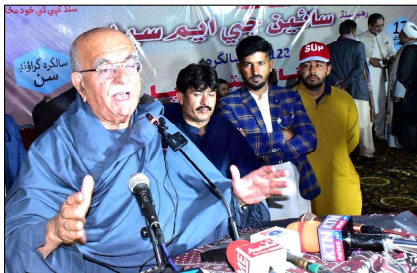
Tehreek Tahafuz Ayeen-e-Pakistan Chief Mahmood Khan Achakzai speaks at GM Syed's 122nd birth anniversary ceremony in Hyderabad.

The suspect involved in the smuggling was arrested on the spot, and a case had been registered under the Punjab Control of Narcotic Substances Act 2025. Further investigation had been initiated.