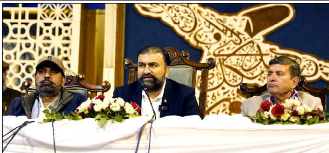
QUETTA: Balochistan Chief Minister Mir Sarfraz Bugti addressing the appointment order distributing ceremony amongst successful candidates of Sub-Accountant posts advertised by Finance Department.