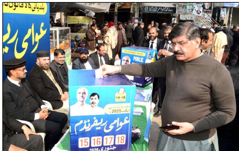
Voters participate in Jamat-e-Islami (JI) organized referendum on Punjab Local Government Act in Multan.