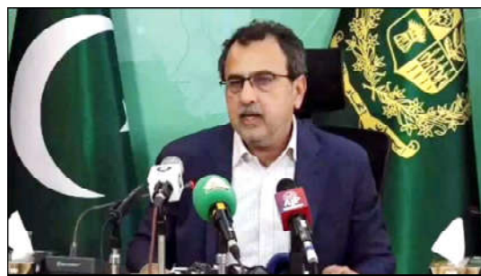
ISLAMABAD: Minister for Power Sardar Awais Ahmed Khan Leghari addressing a news conference.

The involvement of departments and end-users in AI projects is mandatory, with the AI cell providing technical guidance. A dedicated data engineering team has also been added to embed data-driven decision-making across government systems.