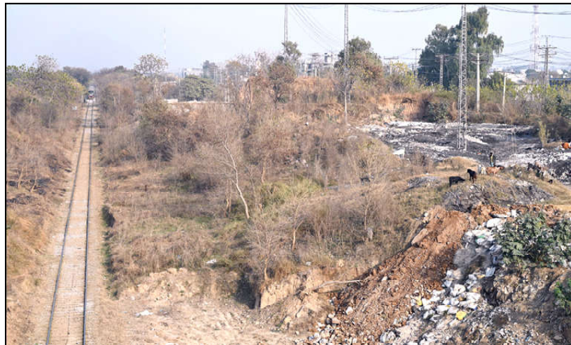
ISLAMABAD: A view of a railway track near Margalla Railway Station as garbage and debris are seen dumped along the sides in the federal capital.

“All issues with Afghanistan should be resolved diplomatically,” the manifesto read, further asking the “unanimous demands” of the Jirga held in the Khyber Pakhtunkhwa Assembly be immediately accepted.