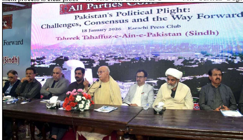
Tehreek Tahafuz Ayeen-e-Pakistan Chief Mahmood Khan Achakzai addresses media at Karachi Press Club during All Parties Conference.