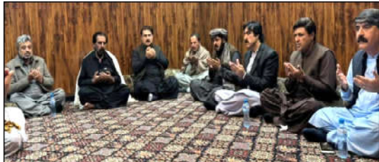
QUETTA: Provincial Minister for Food Haji Noor Muhammad Dummarr offering Fataha on the sad demise of brother of Sardar Afzal Kibzai.

Commissioner's move and expressed hope that it would promote tree plantation in the area.