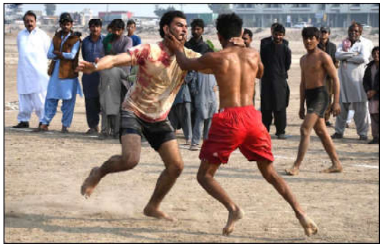
HYDERABAD: Kodi Kodi players in action during All Pakistan Horse Riding Competitions as part of Winter Sports Festival 2026.

The PFF said the teams delivered the wins “despite a lack of Futsal infrastructure in the country and the challenges”, adding that Pakistan women beat Sri Lanka 3-2 while the men’s team “came from behind to win against Bhutan 4-2”.