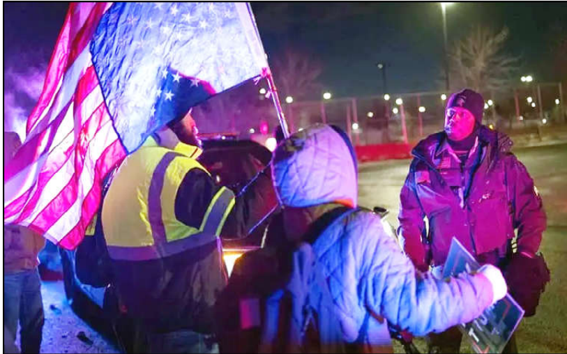
Sheriffs confront anti-ICE demonstrators protesting outside of the Whipple federal building in Minneapolis, Minnesota.

The World Meteorological Organization, the UN's weather and climate agency, said two of eight datasets it analysed showed 2025 was the second warmest year, but the other six datasets ranked it third.