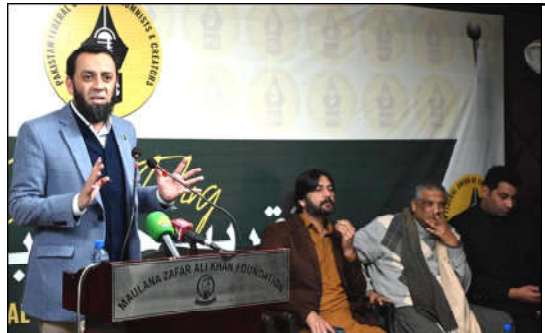
LAHORE: Federal Minister for Information and Broadcasting, Attaullah Tarar addressing during the oath taking ceremony to the Pakistan Federal Union of Columnist and creators (PFUCC) at Maulana Zafar Ali Khan Foundation.

He emphasized the importance of putting the nation's interests first and contributing positively to dialogue and consensus-building.