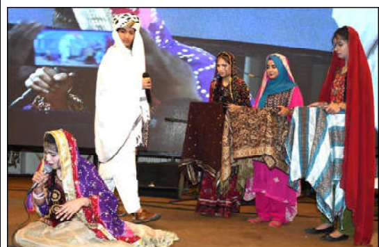
HYDERABAD: Artists perform on stage during the 11th Hyderabad Literature Festival.