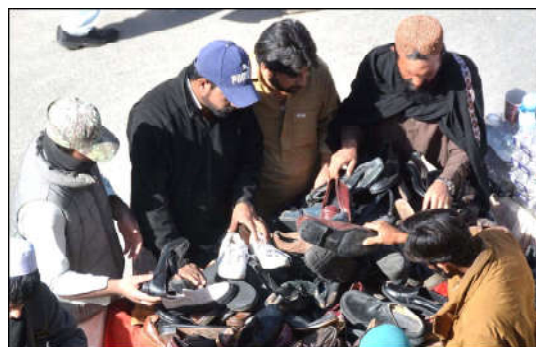
QUETTA: People buying shoes from a stall at joint road's Sunday Bazaar.

The report further notes that Jazz demonstrated the strongest year-on-year improvement, with an 11.2 percent increase in its overall nPerf score, underscoring continued investment in network enhancement, capacity expansion, and service quality improvements.