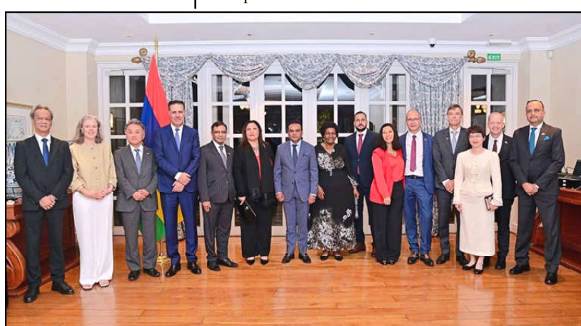
High Commissioner Syed Zahid Raza attended a reception hosted by Foreign Minister Ritesh Ramful. Hon. FM briefed about Mauritius' diplomacy during year 2025 and shared forthcoming international events in Mauritius Office of the Spokesperson, Mofa Pakistan Ministry of Foreign Affairs, Islamabad

The visit coincides with the 75th anniversary of the establishment of diplomatic relations between Pakistan and China, a historic milestone symbolizing the enduring, time-tested, and all-weather friendship between the two nations.