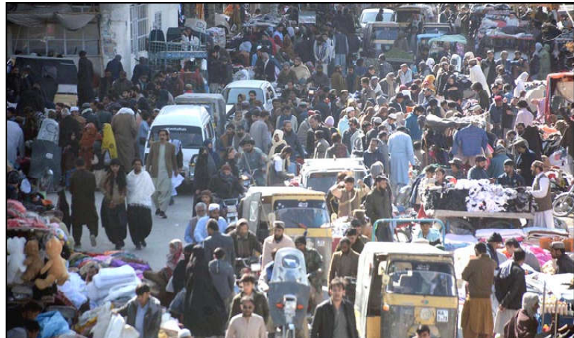
QUETTA: Large number of people visiting Joint road Sunday Bazaar for buy daily commodities.

A large number of other parliamentarians, government officials, lawyers, tribal elders, business community members, representatives of various chambers, doctors, senior officers, journalists, bureaucrats, and academicians also visited the residence of the Deputy Chairman Senate to express their sorrow over the sad demise of the deceased.