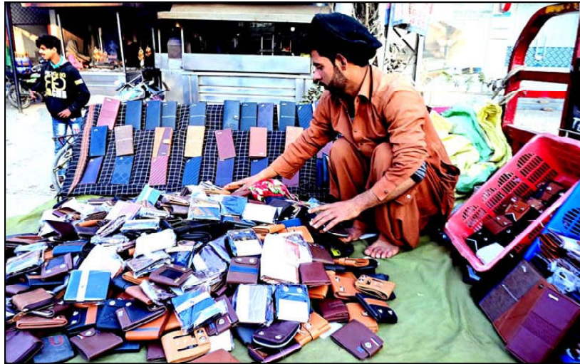
SIALKOT: A vendor sells leather purses at his roadside setup.

The survey found that 56 per cent of participants anticipate a 50 basis points cut in the policy rate, while 15 per cent believe the SBP may opt for a one percentage point reduction. Meanwhile, 20 per cent of respondents expect the central bank to keep the interest rate unchanged, and 5 per cent foresee a 25 basis points cut. Only 3 per cent of survey participants expect a 75 basis points reduction in the policy rate.