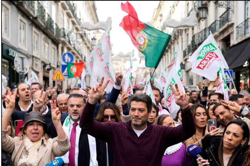
Presidential candidate Andre Ventura, of the populist Chega party, gestures to supporters while campaigning for Sunday's presidential election, in Lisbon, Portugal.

Trump's announcement coincided with mass demonstrations on Saturday in Greenland's capital, Nuuk, and across Denmark.