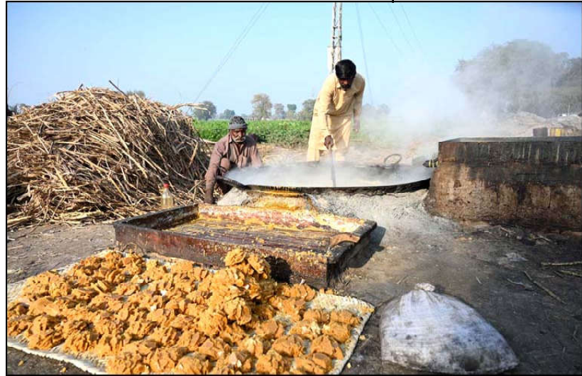
SARGODHA: Workers busy making sweet jaggery (gur) at his roadside setup.

The experience gained from these contract farming initiatives is expected to complement the work of the newly established centre by offering practical, field-level insights and scalable models for agribusiness development.