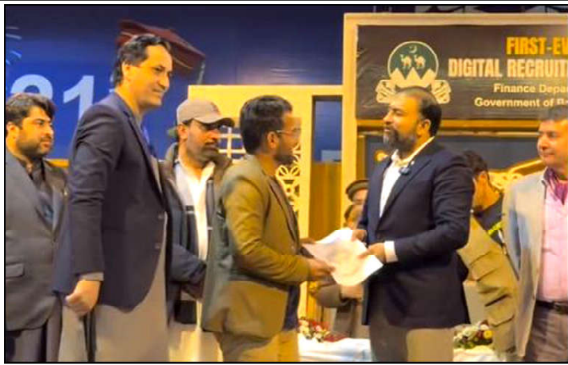
QUETTA: Balochistan Chief Minister Mir Sarfraz Bugti distributing appointment order amongst successful candidates of Sub-Accountant posts advertised by Finance Department.

Secretary General of the Council, Khalid Ijaz Mufti, said that the new moon will be born at 12:52am Pakistan Standard Time on the night between Sunday and Monday (January 18-19). However, at sunset on January 19, the age of the moon across all parts of Pakistan will be less than 18 hours, whereas a minimum of 19 hours is generally required for visibility.