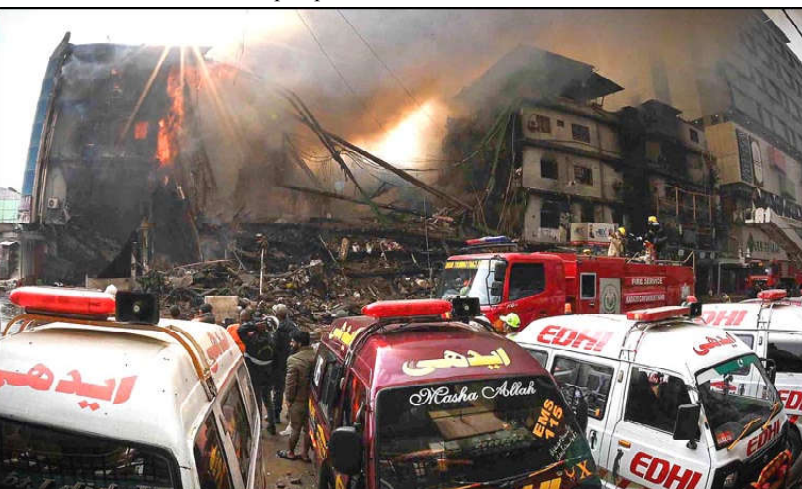
KARACHI: Smoke rises as a blaze continues to engulf from Gul Plaza. Authorities have confirmed six deaths so far, including a firefighter, after the fire erupted at the mall located at MA Jinnah Road.