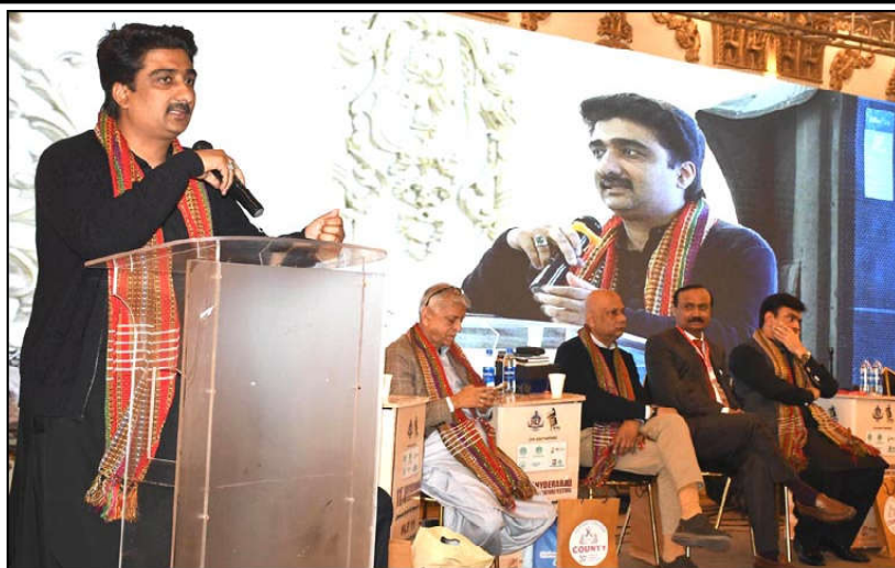
HYDERABAD: Sindh Minister for Culture and Tourism, Syed Zulfiqar Ali Shah addressing during the 11th Hyderabad Literature Festival.

According to a detailed security assessment obtained by The Express Tribune, the province faced 1,588 terrorism-related incidents, reflecting a rapidly escalating militant threat across both settled and tribal regions. Despite the rise in attacks, security forces managed to prevent 320 major strikes, while 137 police officers and personnel laid down their lives in the line of duty.