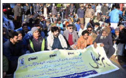
Members of Hyderabad Water and Sewerage Corporation Employees Union protest against Non-Payment of Salaries at Hyderabad Press Club.