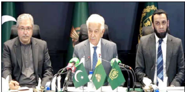
ISLAMABAD: Federal Minister for Defence Khawaja Muhammad Asif along with Information Minister Attaullah Tarar and Prime Minister's Coordinator for Information Ikhtiar Wali Khan addressing a news conference.

The meeting between the prime minister and the delegation reflected Pakistan's broader strategy to promote digital transformation, foster innovation, and pursue a long-term vision for technology-driven public policy by engaging institutional partners with an international outlook, the press release added.