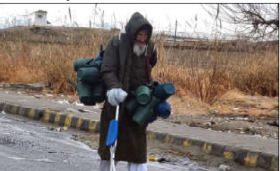
QUETTA: An aged man selling plastic pots to support family during winter season.

of Gwadar. It was used to protect the area from both sides of the sea against the invaders. A huge basement area of the structure shows that it was used to store the weapons or used as a prison. The Omani Watchtower was built to protect the area from the eastern side of the Arabian Sea. It is located in Shahi Bazar, which was famous as a center of trade, according to Gwadar Pro on Tuesday.