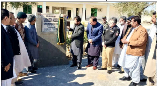
NASIRABAD: Commissioner Nasirabad Salah-ud-Din Noorzai and other officers inaugurate construction work of Circuit House.

Commissioner Noorzai described the renovation as a critical priority and pledged continued efforts to further improve the facility, ensuring high-quality services for visitors. He emphasized that the Circuit House is an important government property and that all available resources were utilized to upgrade it.