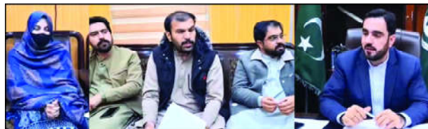
MUSAKHAIL: Deputy Commissioner Abdul Razaq Khajjak presides over the meeting of District Health Committee.

cept papers facilitate swift approval of projects while also guaranteeing transparent and efficient use of public resources. Emphasizing inter-departmental coordination, the Commissioner urged all departments to work closely with one another and ensure that the required concept papers are completed and submitted within the given timeframe. During the meeting, several departments presented their proposals, while challenges faced during preparation and possible remedial measures were discussed in detail.