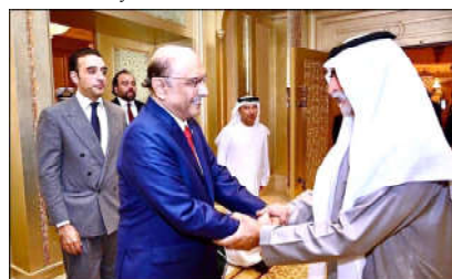
ABU DHABI: President Asif Ali Zardari shaking hands with H.E. Sheikh Nahyan bin Mubarak Al Nahyan, UAE Minister of Tolerance and Coexistence.

He also noted that these values strongly resonated with Pakistan's own commitment to interfaith harmony, social inclusion and respect for cultural and religious diversity, as enshrined in its constitution and societal traditions.