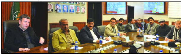
QUETTA: Balochistan Chief Secretary Shakeel Qadir Khan being briefed about measures taken regarding Green Pakistan Initiative during a meeting.

The operation underscores the provincial government's sustained commitment to combating terrorism and safeguarding the lives and property of citizens.