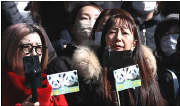
Panda fans gather to see off twin pandas Xiao Xiao and Lei Lei before a truck transporting them departs from Ueno Zoo for their planned return to China, in Tokyo, Japan.

Police are hunting members of the far-left “Vulkangruppe” (Volcano Group) which claimed responsibility for the early January blackout in several online statements. Interior Minister Alexander Dobrindt on Tuesday vowed to “strike back.” “I think it’s appropriate to underscore the seriousness of the situation with a reward of this magnitude,” Dobrindt said.