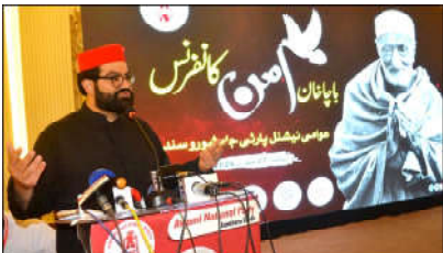
HYDERABAD: Awami National Party central president Aimal Wali Khan addressing to Bacha Khan Peace Conference, organized by Awami National Party Jamshoro district, at local hotel.

"Empowered local government systems are successful in all major cities of the world," he said while highlighting that London and New York in the West, and Tehran and Istanbul in the Muslim world, are successful examples of this model.