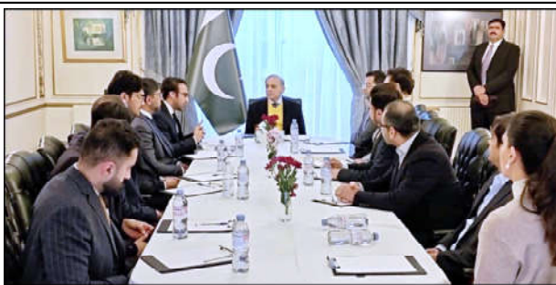
LONDON: A delegation of experts of Artificial Intelligence met with Prime Minister Muhammad Shehbaz Sharif, last week.

Police and rescue teams promptly reached the scene and transferred the deceased and injured to a local hospital.