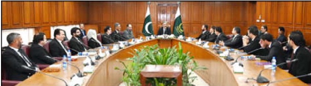
ISLAMABAD: The Hon'ble Chief Justice of Pakistan, Mr. Justice Yahya Afridi, meeting with a delegation comprising members of the Rawalpindi High Court Bar Association, Tehsil Bar Association Kabal, and Mohmand Bar Association, Mohmand District, at the Supreme Court of Pakistan.

"Our response established that there can be no new normal based on coercion or impunity," he said, adding that "respect for international law remains the only legitimate norm governing interstate conduct."