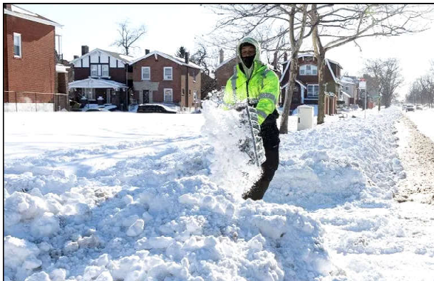
A city worker shovels heavy snow from a sidewalk in a residential neighborhood in the aftermath of a winter storm in the St. Louis area, Missouri, US.

“Every such Russian strike erodes the diplomacy that is still ongoing and undermines the efforts of partners who are helping to end this war,” he wrote on social media.