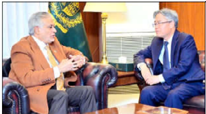
ISLAMABAD: Deputy Prime Minister and Foreign Minister Ishaq Dar talking to Chinese Ambassador Jiang Zaidong.

Reaffirming the government's resolve, Mir Sarfraz Bugti said that providing equal opportunities for women across every sector remains a central element of the govt's wider vision.