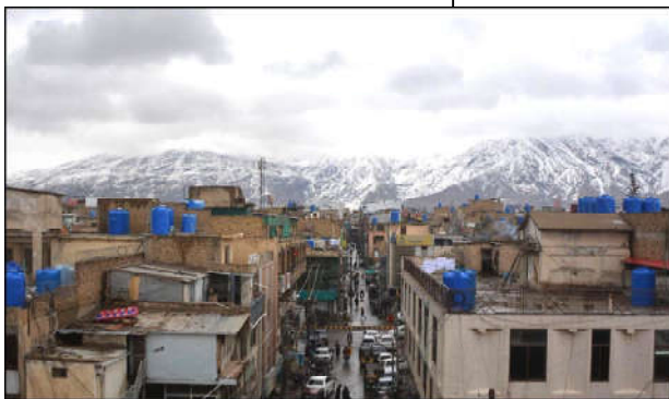
QUETTA: A view of rainy weather in provincial capital.