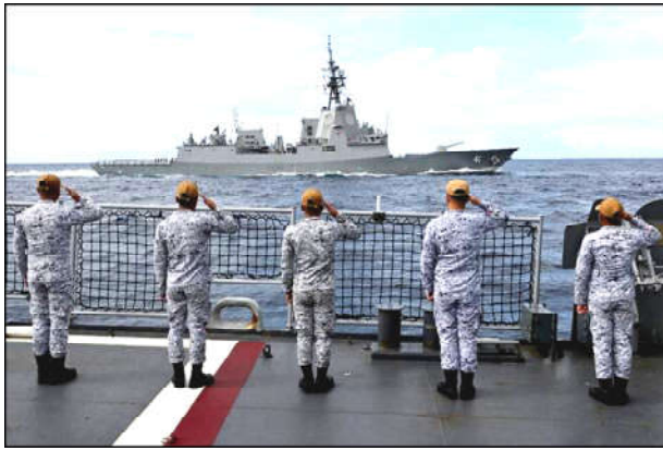
Sailors aboard the Philippine Navy frigate BRP Jose Rizal salute during near Scarborough Shoal in disputed waters of the South China Sea.