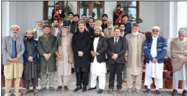
PESHAWAR: Governor Khyber Pakhtunkhwa Faisal Karim Kundi in a group photo with a delegation of Utman Khel Qoumi Itihad who called on him at Governor House.

Commenting on the Gul Plaza tragedy, the Sindh minister said that visits to the homes of victims should be for condolence, not political propaganda. He announced that compensation cheques were now being personally delivered to the families of the deceased and affected individuals, adding that attempts to spread misinformation would be firmly rejected.