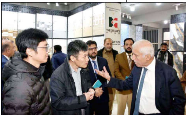
FAISALABAD: Federal Minister for Board of Investment, Mr. Qaiser Ahmed Sheikh, visited the Faisalabad Industrial Estate Development and Management Company (FIEDMC) to review the progress of Special Economic Zones (SEZs) in Faisalabad.

The price of 10 grams of 24-karat gold fell by Rs1,286 to Rs454,871, while the price of 10 grams of 22-karat gold went down by Rs1,179 to Rs416,980, according to the All Pakistan Sarafa Gems and Jewellers Association. However, Silver prices witnessed an upward trend, with the price of 24-karat silver per tola increasing by Rs212 to Rs11,640, whereas the price of 10 grams of silver went up by Rs182 to Rs9,979.