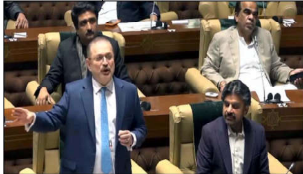
Sindh Minister for Information, Transport and Mass Transit Sharjeel Inam Memon addresses Provincial Assembly Session at Sindh Assembly Building in Karachi.

Investigations have revealed that billions of rupees were collected from the public under pretences, causing massive financial losses to investors. NAB officials stated that further investigations are underway to trace the looted amount and identify all individuals involved in the scam. NAB KP has urged all affected individuals to submit their claims along with relevant documents at the NAB KP office at the earliest to facilitate recovery proceedings.