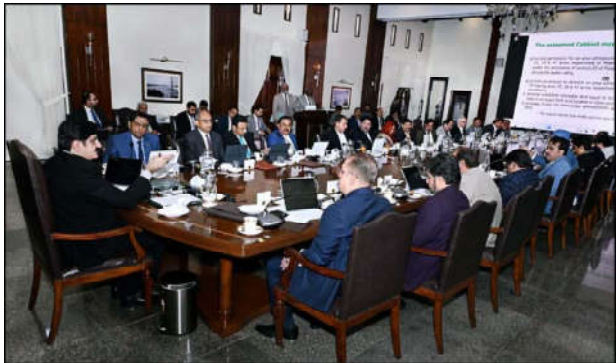
Sindh Chief Minister Syed Murad Ali Shah presides over cabinet meeting at CM House in Karachi.

"These projects are essential for easing congestion, improving road safety, and supporting Karachi's economic activity," Murad Shah said, directing the Local Government Department to commence work without delay.