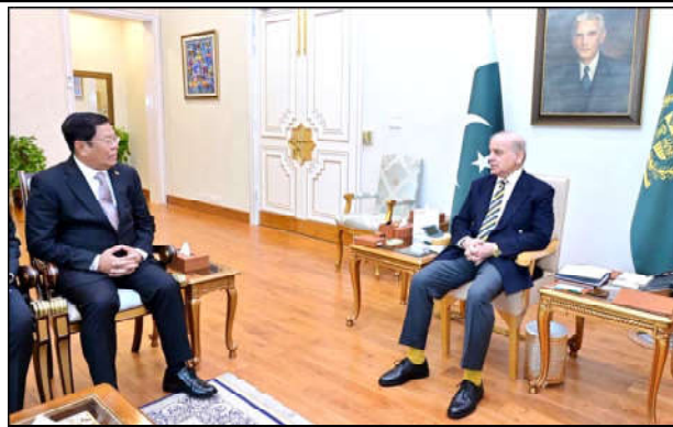
ISLAMABAD: The Union Minister for Foreign Affairs of the Republic of the Union of Myanmar, H.E. U Than Swe called on Prime Minister Muhammad Shehbaz Sharif.

According to family sources, his funeral prayers will be offered after Asr prayers at the 'H-11 cemetery in Islamabad', and friends, colleagues, and fans are expected to pay their respects.