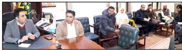
QUETTA: Commissioner Quetta Division Shahzeib Khan Kakar presides over the meeting to review overall situation of anti-polio campaign.

operational hurdles and sectors where performance fell short. He instructed officials to focus special attention on low-performing union councils and to introduce effective, targeted strategies to improve outcomes. Emphasizing transparency and efficiency, the commissioner called for further strengthening of the monitoring mechanism, recommending that specific monitors be assigned to individual union councils to enable continuous oversight.