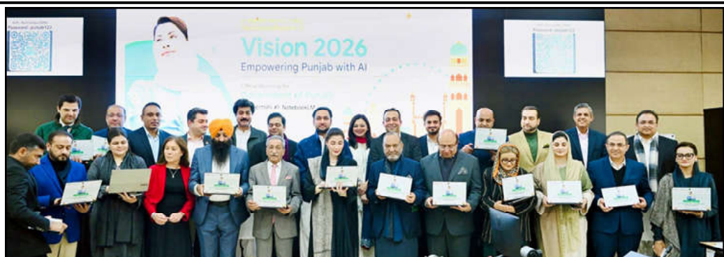
LAHORE: Punjab Chief Minister Maryam Nawaz Sharif in a group photo with Provincial Ministers Overtake Valley Google for Education team after completion of training session "Empowering Punjab with AI".

Issues related to the plot allocated for the Nepali Embassy in the Diplomatic Enclave were also reviewed.