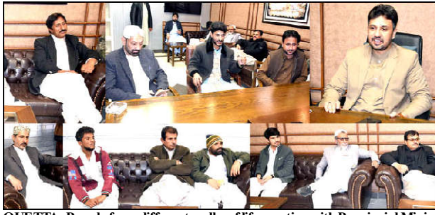
QUETTA: People from different walks of life meeting with Provincial Minister for Finance Mir Shoaib Noshervani.

in several districts. Pishin received 6.0 mm of rain, followed by Quetta city with 2.4 mm, Ziarat with 2.0 mm, Samungli with 1.0 mm, and Brewery with 0.8 mm. Light rainfall, recorded as trace amounts, was also reported in Muslim Bagh and Noshki. No snowfall was observed anywhere in the province during the same period.