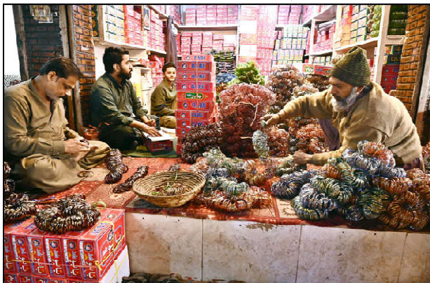
HYDERABAD: Workers arrange bangles at their workplace in the Bangles Market. The bangles are supplied from Hyderabad to shops across the country.