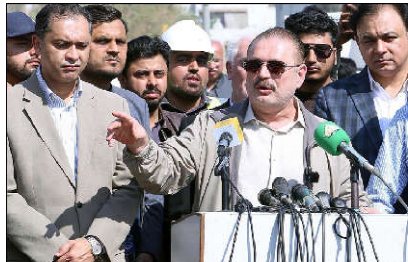
KARACHI: Sindh Minister for Information, Transport and Mass Transit Sharjeel Inam Memon reviews development projects at NIPA Chowrang.

The Federal Secretary and the PIO lauded the role of the RIUJ, stating that the union plays a vital part in protecting the collective interests of the journalistic community.