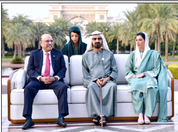
DUBAI: President Asif Ali Zardari in a meeting with Sheikh Mohammed bin Rashid Al Maktoum, Vice President and Prime Minister of the United Arab Emirates and Ruler of Dubai.