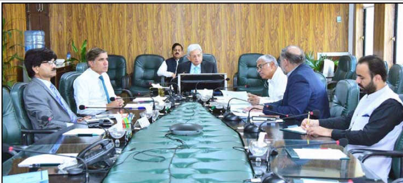
ISLAMABAD: Federal Minister for National Food Security and Research Rana Tanveer Hussain chairing 4th meeting of the National Wheat Oversight Committee.

In a related decision, the committee approved the provision of 300,000 metric tons of PASSCO wheat to the Food and Consumer Protection Department of the Government of Punjab, aimed at maintaining adequate wheat supplies for flour mills, stabilizing prices and ensuring uninterrupted availability of wheat flour to consumers.