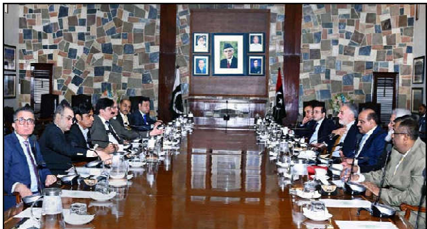
Sindh Chief Minister Syed Murad Ali Shah and Chairman National Accountability Bureau Lt. Gen (Rtd) Nazir Ahmed Collaborate Against State Land Fraud in Sindh.

Highlighting future-oriented reforms, CM Maryam Nawaz said artificial intelligence (AI) education has been made mandatory in schools, adding that she herself had attended an AI training session along with provincial ministers, a first for any chief minister. "In the age of AI, every decision must be knowledge-based," she remarked.