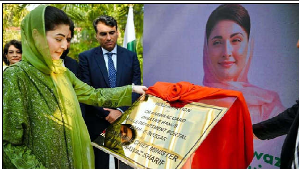
LAHORE: Punjab Chief Minister Maryam Nawaz has launched Parwaz Card, Rah-e-Rozgar and Skill Development Portal.