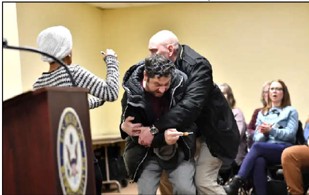
A man is tackled after spraying an unknown substance at US Representative Ilhan Omar during a town hall she was hosting in Minneapolis, Minnesota.

But Russia's continued sheltering of Assad and his wife since their ouster remains a thorny issue. Sharaa has repeatedly pushed Russia for their extradition.