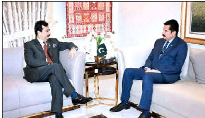
ISLAMABAD: Acting President, Syed Yousuf Raza Gilani in a meeting with Governor Khyber Pakhtunkhwa, Faisal Karim Kundi.

Reiterating his administration's resolve, the Chief Minister affirmed that unwavering support for law enforcement agencies will persist until durable peace is achieved throughout the province. He added that every available resource is being deployed to ensure a secure and peaceful environment for the people of Balochistan.