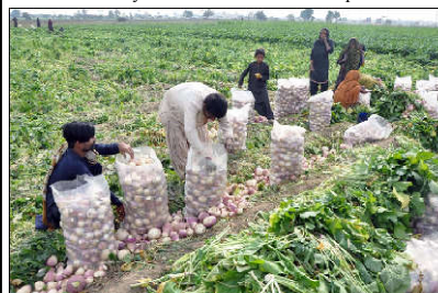
Farmers in Hyderabad Pack Unripe Vegetables for Market Dispatch.

The Power Division further confirmed that all DISCOs have been issued directives in this regard for immediate implementation.