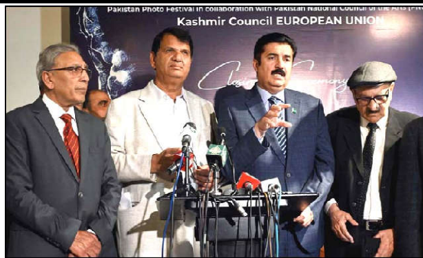
ISLAMABAD: Governor of Khyber Pakhtunkhwa, Faisal Karim Kundi addresses the closing ceremony of the photography exhibition and book launch titled 'KASHMIR, WAIT & SEE' by Shah Zaman Baloch and internationally renowned photographer CA©dric Gerbehe at PNCA.