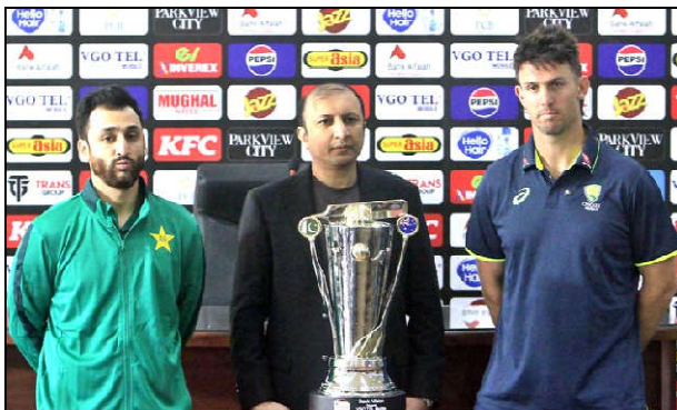
LAHORE: Pakistan's T20 team captain Salman Ali Agha, and his Australian counterpart Mitchell Marsh pose for photograph with T20 Series Trophy at Gaddafi Stadium.

Mitchell Marsh ©, Adam Zampa, Ben Dwarshuis, Cameron Green, Cooper Connolly, Jack Edwards, Josh Inglis, Josh Philippe, Mahli Beardman, Marcus Stoinis.