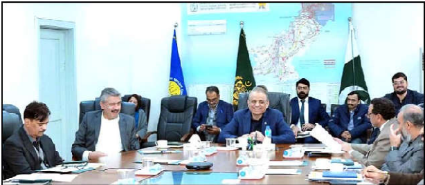
ISLAMABAD: Federal Minister for Communications Abdul Aleem Khan presides over high level meeting of NHA.

"Infrastructure for its own sake is not enough. Our objective is to translate connectivity into productivity, productivity into exports, and exports into jobs and sustainable growth," he said.