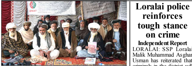
QUETTA: Retired employees of Federal Levies Force protest for acceptance of demands at Quetta Press Club.

Strict measures were taken against illegal arms, with 113 cases registered and 180 accused arrested. Weapons were recovered from their possession, reflecting police vigilance against threats to public safety. To improve traffic discipline, 733 individuals were fined for violations, generating Rs 584,700 in fines deposited into the national treasury.