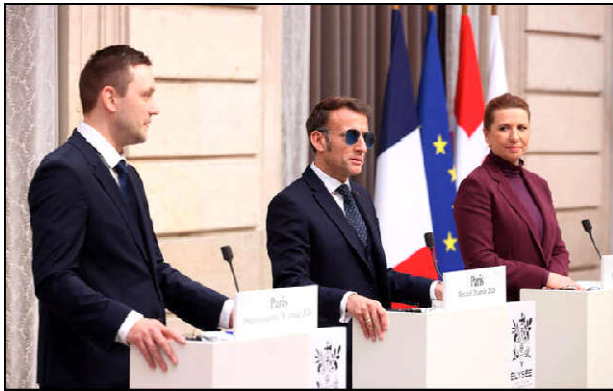
French President Emmanuel Macron, Denmark's Prime Minister Mette Frederiksen, and Greenland's Prime Minister Jens-Frederik Nielsen speak to the media as they meet at the Elysee Palace in Paris.

Since leaving in 2004 - the same year Poland became a member of the European Union - the country has become the world's 20th largest economy, and its GDP per capita has more than tripled.