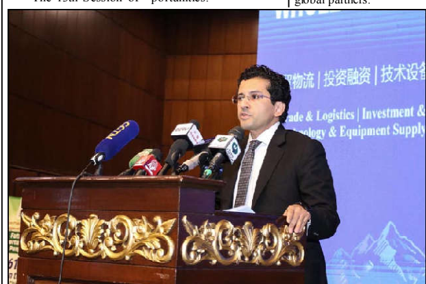
Federal Minister for Petroleum, Ali Pervaiz Malik addressing the Pak China Minerals Cooperation Forum in Islamabad.

the ePakistan-Sri Lanka Joint Economic Commission (JEC) was held in Colombo. A key outcome of the session was the decision to establish a Joint Working Group on IT and Digital Economy, reflecting both countries' resolve to collaborate in emerging technologies and digital transformation. The two sides also agreed to enhance cooperation in advanced and innovative technological fields. Discussions were held on expanding industrial collaboration and increasing bilateral trade, with Sri Lanka inviting Pakistani pharmaceutical companies to explore investment opportunities.