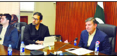
QUETTA: Balochistan Chief Secretary Shakeel Qadir Khan presides over the meeting to review preparation of PSDP 2026-27.

According to court records, the case involves accusations of spreading misleading claims and hampering the credibility of state institutions. The complaint has been registered under the Prevention of Electronic Crimes Act (PECA).