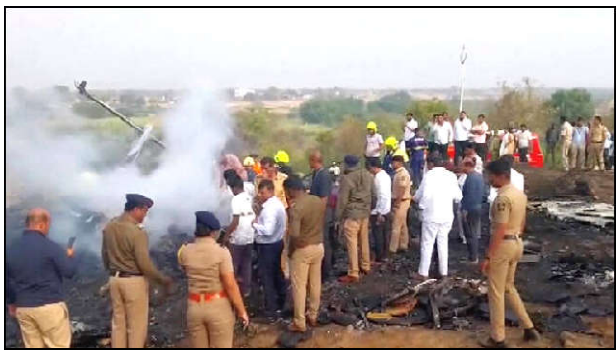
Emergency personnel and people gather at the site of a plane crash, in which Maharashtra's Deputy Chief Minister Ajit Pawar and four others were killed, in Baramati, Maharashtra, India.

Other humanitarian organizations are bringing in tents, blankets, mattresses and other essentials thanks to WFP's shared logistics services.