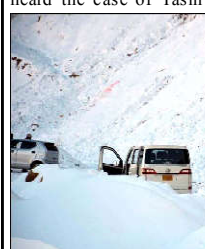
QUETTA: People enjoy snowfall in the Hanna Orak area of the city.

Addressing a ceremony at Sultana Foundation on Wednesday, Mustafa Kamal praised the foundation for rendering valuable services in the fields of education and health for a long time, which is highly commendable.