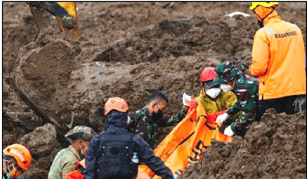
Indonesian rescue members carry a body bag containing the remains of a victim from the site of a landslide following heavy rains in Pasir Langu village, West Bandung regency, West Java province, Indonesia.

West Java's governor Dedi Mulyadi blamed the landslide on the sprawling plantations around Pasirlangu, which is mostly used to grow vegetables, and pledged to relocate affected residents.