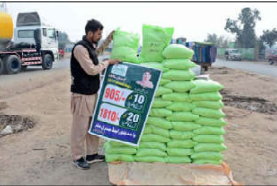
MULTAN: A vendor displays subsidized wheat flour bags along with a price list at a roadside stall under the Punjab government's relief initiative.

Governor Khyber Pakhtunkhwa appreciated HBK's assurance of cooperation in promoting sports and projecting a positive image of the province.