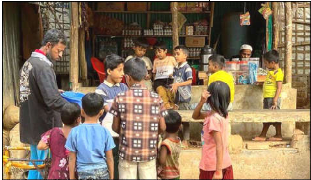
Rohingya refugee children surround a street vendor at the Kutupalong refugee camp in Ukhiya.

Just days into US President Donald Trump's second term, he threatened to take back the canal—built by the United States and handed to Panama in 1999—claiming Beijing was effectively "operating" it.