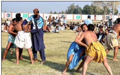
Sindh Traditional Wrestling Malh held in Naundero organized by the Sports and Youth Affairs Department Government of Sindh.

Residents have voiced serious concerns that the ongoing restrictions are disrupting everyday life, trade, education, and communication across the province. They have urged the authorities to adopt a more balanced approach that ensures security objectives are met without placing undue strain on the public or undermining essential civilian needs.