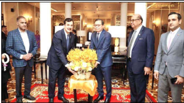
CAMBODIA: Flowers are being presented to Honorable Chairman Senate of Pakistan, Syed Yousuf Raza Gilani, arrived in Phnom Penh official visit to the Kingdom of Cambodia.