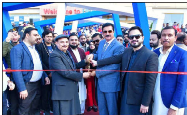
ISLAMABAD: Governor Khyber Pakhtunkhwa Faisal Karim Kundi inaugurates HBK Hyper Market in Islamabad.

On a month-on-month basis, the imports from Italy also increased by 163.44 percent during December 2025 as compared to the import of US$30.239 million in November 2025, SBP data said.