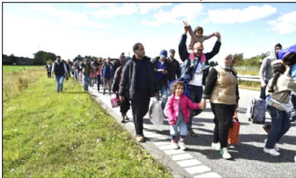
Denmark will expel non-Danish citizens who have served prison terms of a year or more for serious crimes, part of new measures to tighten immigration policy.

WASHINGTON (AFP/APP): President Donald Trump on Thursday said Bombardier jets and other Canadian aircraft would lose their US certification until Canada approves American-made Gulfstream planes, in his latest dustup with Ottawa. Writing on his Truth Social network, Trump charged that "Canada has wrongfully, illegally, and steadfastly refused" to grant certification to American Gulfstream 500, 600, 700, and 800 aircraft and jets. "We are hereby decertifying their Bombardier Global Expresses, and all Aircraft made in Canada."