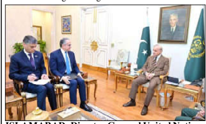
ISLAMABAD: Director General United Nations Educational, Scientific and Cultural Organization (UNESCO), H.E. Dr. Khaled El-Enany called on Prime Minister Muhammad Shehbaz Sharif.

The prime minister highlighted various initiatives being undertaken by the Government of Pakistan for the promotion of education, particularly the "Education Emergency" that aims to maximize the enrollment of out-of-school children.