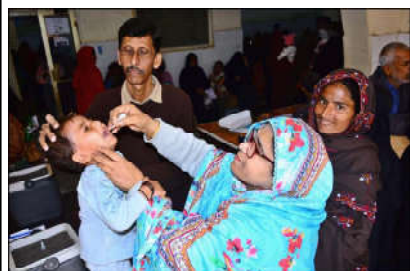
HYDERABAD: A health worker administers polio vaccine drops to a child during an anti-polio campaign at Government Bhitai Hospital.

Emphasizing economic revival, Malik Muhammad Ahmad Khan underscored that the confidence and encouragement of the business community was an urgent national priority.