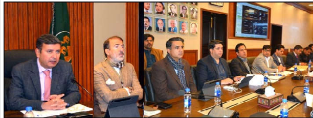
QUETTA: Balochistan Chief Secretary Shakeel Qadir Khan addressing the Commissioners and Deputy Commissioners Conference.