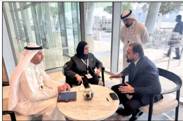
DUBAI: Federal Minister for Overseas Pakistanis and HRD, Chaudhry Salik Hussain, meeting with H.E. Rabab Abdullah Al-Osaimi, Director-General of Kuwait's Public Authority for Manpower, on the sidelines of the Abu Dhabi Dialogue 2026.

The delegation briefed the Finance Minister on Wafi Energy Pakistan's current operations in the country and shared that the company operates an extensive nationwide retail network, supported by ongoing investments in modernization and efficiency.