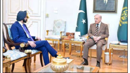
ISLAMABAD: Ajay Banga, President, World Bank Group (WBG) calls on Prime Minister Muhammad Shehbaz Sharif.

Imran Hussain reaffirmed that he would continue to raise the Kashmir issue effectively in the British Parliament.