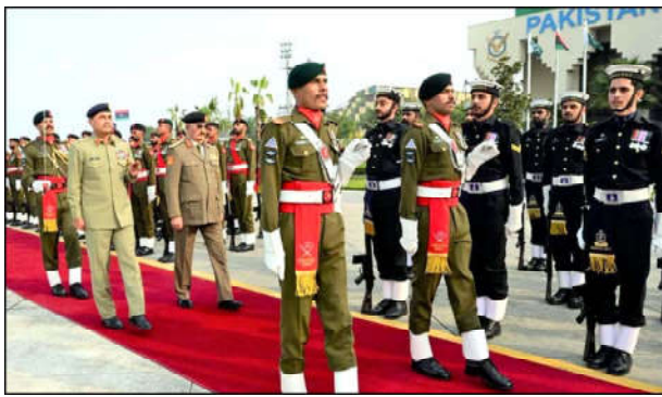
Libyan Arab Armed Forces Commander-in-Chief Field Marshal Khalifa Abu-Al-Qasim Haftar reviews guard of honor at General Headquarters in Rawalpindi.

Shehbaz Sharif emphasized that our water resources, including lakes and glaciers, inland water bodies and coastal and mangrove biodiversity, are crucial for environmental conservation, climate change mitigation and water management. He said the conservation of water resources is not just an environmental duty to combat climate change.