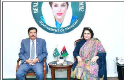
ISLAMABAD: Governor Khyber Pakhtunkhwa Faisal Karim Kundi meets Chairperson BISP Rubina Khalid at his office.