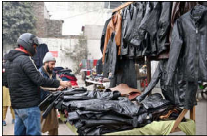
SIALKOT: A customer purchases a leather jacket from a roadside vendor.

"Coastal communities in Sindh and Balochistan have historically practiced sustainable fishing and mangrove protection, contributing to ecosystem resilience," he noted, calling for the integration of this wisdom into modern environmental policies.