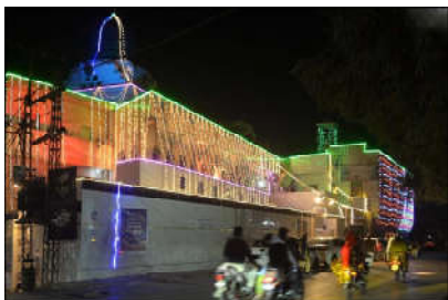
HYDERABAD: A view of Allah Wali Masjid illuminated with colorful lights in connection with Shab-e-Barat.