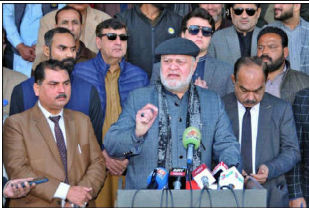
MULTAN: Federal Minister for Poverty Alleviation and Social Safety Syed Imran Ahmed Shah talking to media at Nishtar Hospital.

The law minister explained that multiple schemes were delayed due to pending court cases, making it impossible to reallocate the funds.