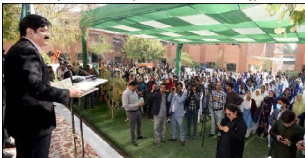
Sindh Chief Minister Syed Murad Ali Shah launches province-wide anti-polio campaign in Karachi.

The briefing further revealed that the Punjab Transport Company had launched the "Empower Her" initiative to promote women's economic independence. Under the programme, special tuck shops had been established at e-bus stations for widowed and divorced women, providing them with safe, dignified, and self-reliant business opportunities.