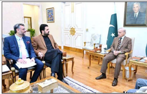
ISLAMABAD: Chief Minister Khyber Pakhtunkhwa, Sohail Afridi calls on Prime Minister Muhammad Shehbaz Sharif.

The Quetta Police reiterated their commitment to serving the public and maintaining order under all circumstances.