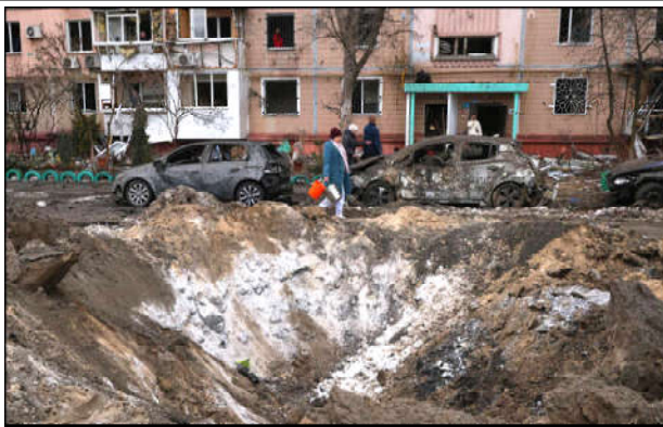
Russia has launched 841 strikes at 34 settlements in the Zaporizhzhia region. Above, a crater and damaged cars near an apartment building after a Russian attack in Zaporizhzhia.

The pause had initially been discussed last weekend during three-way talks in Abu Dhabi between Russia, Ukraine and the United States, Zelensky said.