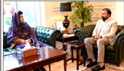
QUETTA: Provincial Minister for Education Rahela Hameed Khan Durrani meeting with Balochistan Chief Minister Mir Sarfraz Bugti.

A GDA official told Gwadar Pro that provision of these 50 large-sized garbage containers aims to prevent the vicinity of "Mullah Fazal Chowk" from getting littered. They will help enhance the beauty of city, he added. Later, Gwadar Smart Environment Sanitation System and Landfill Project will also yield a positive impact. It will help lift, recycle and dump all kinds of residential and commercial waste through state-of-the-art SOPs and modern machinery.