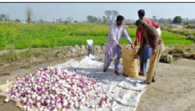
BAHAWALPUR: Farmers pack turnips into bags for transportation to the vegetable market.