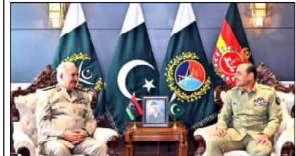
Chief of Defence Forces and Chief of Army Staff Field Marshal Syed Asim Munir meets with Field Marshal Khalifa Abu-Al-Qasim Haftar, Commander-in-Chief of the Libyan Arab Armed Forces at General Headquarters in Rawalpindi.

The dignitary also paid homage to Shuhada and laid wreath at martyrs memorial at GHQ.