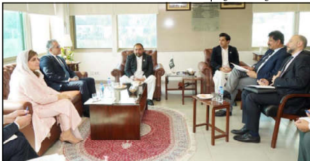
ISLAMABAD: Federal Minister for National Heritage and Culture and UNESCO Director-General Dr. Khaled El-Enany held a high-level meeting, agreeing to expand cooperation in heritage preservation and cultural promotion.

Counsel for the brick kiln owners denied the allegations, maintaining that the workers had received advance payments and were working voluntarily under an agreement.