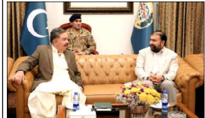
QUETTA: Balochistan Chief Minister Mir Sarfraz Bugti in a meeting with Balochistan Governor Jaffar Khan Mandokhail.