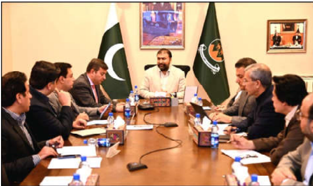
QUETTA: Balochistan Chief Minister Mir Sarfraz Bugti presides over a high-level review meeting on progress of Trauma Centres at the Chief Minister's Secretariat.

Emphasizing close relations and effective coordination between the federation and the provinces as key to national progress and public service, Prime Minister Shehbaz also assured cooperation within the federal framework for development projects in KP, improvement of basic infrastructure, education,