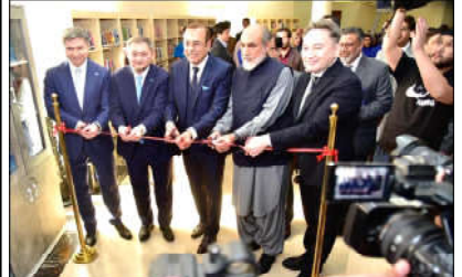
ISLAMABAD: Federal Minister for Science and Technology, Khalid Hussain Magsi, and Mr. Sayasat Nurbek, Minister of Science and Higher Education of the Republic of Kazakhstan, jointly inaugurated the Satbayev Cultural Center at NUST.

Mian Khan Bugti also strongly condemned the terrorist attack in Balochistan and alleged that India was involved in the unrest in the province.