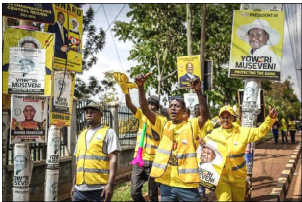
Supporters of Uganda's incumbent president and National Resistance Movement presidential candidate Yoweri Museveni chant and hold electoral posters as they head to the rally grounds ahead of the party's closing campaign rally ahead of the 2026 Ugandan general elections, in Kampala.

To deepen cooperation in education, it was agreed to hold the fourth Rectors' Forum in Bukhara this spring.