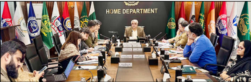
LAHORE: Provincial Minister for Health and Chairman Cabinet Committee for Law and order Khawaja Salman Rafique presides over the meeting to review law and order situation.

The delegation apprised him of various civic problems being faced by residents of the area.