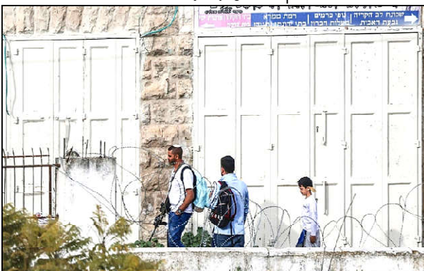
HEBRON: Armed Israeli settlers walk near the settlement of Abraham Avino in this Israeli-occupied West Bank city.

"Israel remains an occupying power in the West Bank, and as an occupying power it is a violation of international law to build settlements, including transferring certain administrative functions to civilian Israeli authorities," a German foreign ministry spokesman said in Berlin.