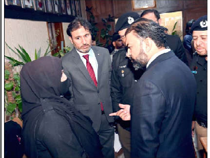
QUETTA: Balochistan Chief Minister Mir Sarfraz Bugti talking to women performing security duties in Balochistan Assembly.

Commissioner Shahzaib Khan Kakar described the minerals sector as the backbone of the provincial economy, emphasizing that its development would generate substantial employment opportunities.