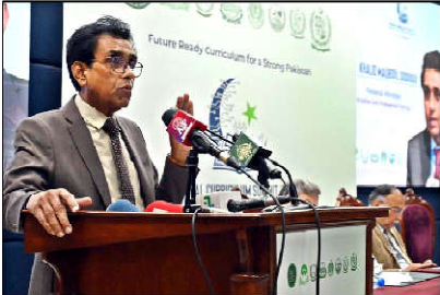
ISLAMABAD: Federal Minister for Education and Professional Training, Dr. Khalid Maqbool Siddiqui, addressing during 2-day "National Curriculum Summit 2026" at AIQU.

He said that this policy would provide timely treatment facilities to government employees, adding that all the employees from grades one to 15 and above are very close to our hearts. He maintained that the policy would reduce the pressure on the health system as a whole and also praised the Health Department and the Finance Department for formulating the best policy.