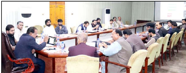
SIBI: Commissioner Sibi Division Asadullah Faiz chairs Divisional EPI Task Force.

The Deputy Commissioner instructed the Education Department to provide all necessary facilities to ensure a comfortable and stress-free experience for students. Officers were directed to monitor the centers daily, address complaints immediately, and guarantee proper heating and adequate furniture for examinations.