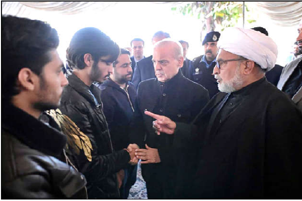
ISLAMABAD: Prime Minister Muhammad Shehbaz Sharif meets with the affected families of terrorist attack on Imam Bargah Khadija-ul-Kubra.