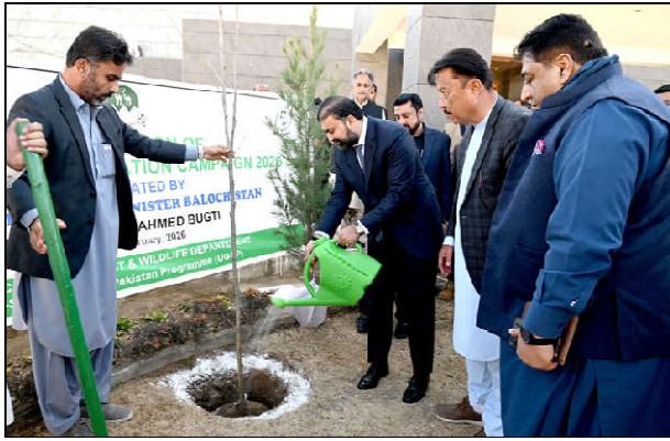
QUETTA: Chief Minister Balochistan Mir Sarfraz Bugti inaugurating tree plantation campaign 2026 in province by planting a tree at CM's Secretariat Quetta.

Following directives from Chief Minister Balochistan Mir Sarfraz Bugti and Provincial Minister for Forests Sardar Masood Luni, the secretary issued instructions to departmental officers to not only execute a comprehensive tree plantation campaign across the province but also to implement stringent post-plantation care measures.