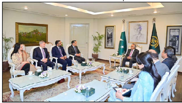
A joint delegation of the Economic-Pakistan American Council and the United Muslim American Association meeting with Deputy Prime Minister and Foreign Minister Ishaq Dar in Islamabad.

The ceremony recognized prominent exporters for their exceptional contributions to strengthening Pakistan's export sector and promoting the country's economy at the global level.