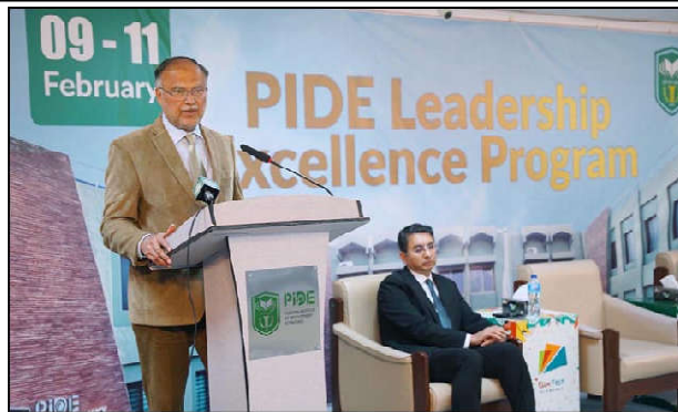
ISLAMABAD: Federal Minister for Planning, Development and Special Initiatives Ahsan Iqbal, addressing the closing ceremony of the three-day Leadership Excellence Workshop organized by the Pakistan Institute of Development Economics (PIDE).

The Shura strongly condemned alleged electoral engineering during the 2024 general elections, describing the manipulation of results through Form-47 as a dangerous precedent that undermines public trust and national stability. It called for transparent, impartial elections and a fully empowered Election Commission.