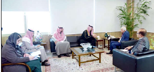
ISLAMABAD: Federal Minister for Board of Investment (BOI), Qaiser Ahmed Sheikh, meets with a KYAN delegation from Saudi Arabia.

During the session, the ready market recorded a trading volume of 734.671 million shares with a traded value of Rs 35.393 billion, against 1,062.309 million shares valuing Rs 37.883 billion in the previous session. Market capitalization increased to Rs 20.710 trillion from Rs 20.634 trillion a day earlier.