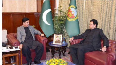
PESHAWAR: Governor Khyber Pakhtunkhwa Faisal Karim Kundi in a meeting with Opposition Leader Dr. Ibadullah Khan at Governor House.

He said such initiatives encourage merit, dedication, and a spirit of service among the youth. He also commended the leadership of the Youth Parliament for promoting positive engagement and national harmony.