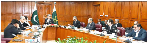
ISLAMABAD: Chief Justice of Pakistan, Mr. Justice Yahya Afridi, chairing the 57th meeting of the NJPMC at the Supreme Court of Pakistan.