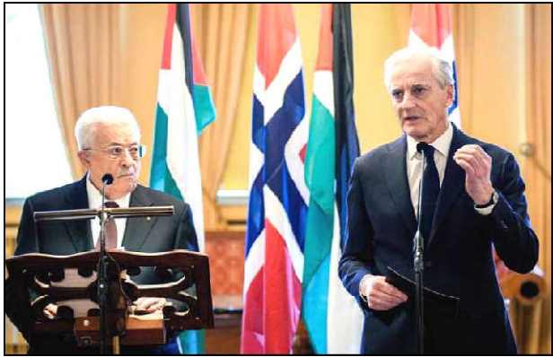
Norway's Prime Minister Jonas Gahr Store and Palestinian President Mahmoud Abbas address the press after a meeting in Oslo.

He said he stayed in lockdown for more than two hours until police stormed in, ordering everyone to put their hands up before escorting them out of the school.