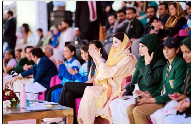
Punjab Chief Minister Maryam Nawaz Sharif opens Khelta Punjab Pink Games 2026 at Punjab Stadium in Lahore.

The meeting decided that, in addition to monitoring governance and development projects in these districts, the special sub-committee will create opportunities for alternative employment to ensure sustainable income for the local population. It will also make effective arrangements to address the issues of temporarily displaced persons.