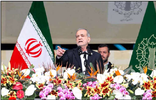
Iranian President Masoud Pezeshkian has insisted that his nation is 'not seeking nuclear weapons' during a speech commemorating the 47th anniversary of the Islamic Revolution in Tehran.