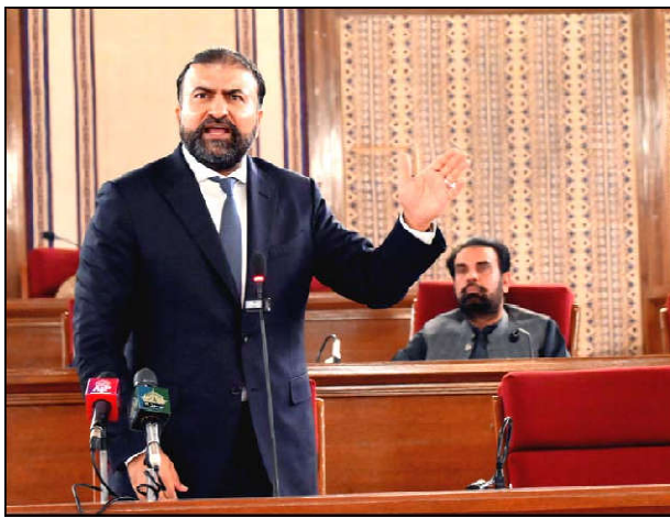
QUETTA: Balochistan Chief Minister Mir Sarfraz Bugti addressing during Balochistan Assembly session.

The Minister also noted the growing influence of artificial intelligence across all sectors.