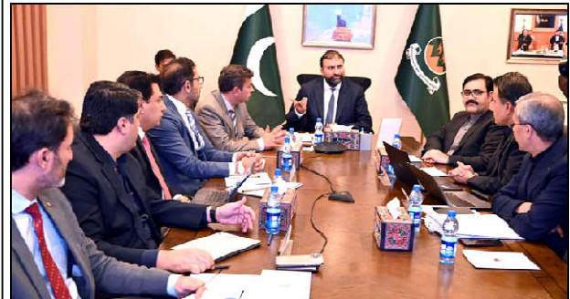
QUETTA: Balochistan Chief Minister Mir Sarfraz Bugti chairing a review meeting on progress regarding proposed insurance policy for treatment of government employees, measures related to rehabilitation of Civil & Bolan Medical Complex Hospitals.

On the financial front, he informed the delegation that the government is making all its repayments smoothly while exploring access to international debt markets through approved programs, including the inaugural Panda Bond and Global Medium-Term Note (GMTN) framework.