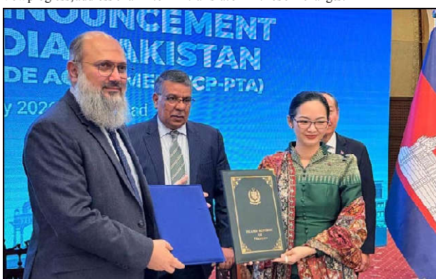
ISLAMABAD: Federal Minister for Commerce Jam Kamal Khan and Cham Nimul, Minister of Commerce of the Kingdom of Cambodia, exchange signed copies of the Joint Statement following the 2nd Pakistan-Cambodia Joint Trade Committee (JTC) meeting, reaffirming their commitment to enhanced bilateral trade and institutional cooperation.