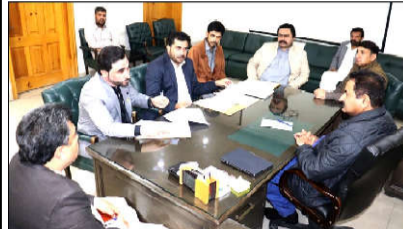
QUETTA: Secretary Local Government and Rural Development Abdul Rauf Baloch presides over the meeting regarding properties of Metropolitan Corporation Quetta.

The Balochistan government reiterated its commitment to addressing public grievances effectively and fostering peace, aiming to create an environment conducive to stability and regional development.