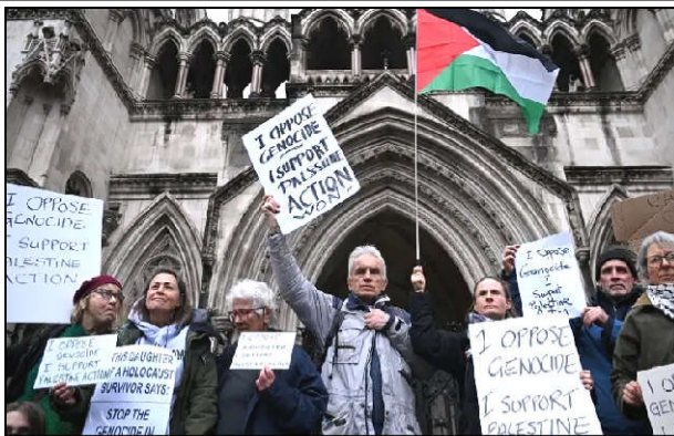
Protesters hold signs outside the Royal Courts of Justice, after High Court judges ruled the British government's decision to designate pro-Palestinian group Palestine Action as a terrorist organisation unlawful, in London, Britain

In its manifesto, the BNP promised to prioritise job creation, protect low-income and marginal households and ensure fair prices to farmers.