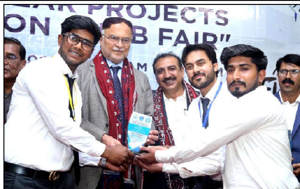
JAMSHORO: Federal Minister for Planning, Development and Special Initiatives Ahsan Iqbal distributes shields among participating students at the IMCS Tech Expo 2026 Final Year Projects Exhibition & Job Fair held at University of Sindh.