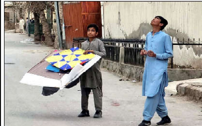
QUETTA: Youth celebrate Basant Festival in Quetta by flying Kites.

to discuss strategies for safeguarding women's rights, promoting gender equality, and advancing sustainable development goals. Kiran Baloch underscored that genuine empowerment requires providing women with access to education, healthcare, economic independence, and political opportunities. She stressed that women must be placed at the core of decision-making processes to achieve lasting societal impact. Participants at the meeting pledged to enhance collaboration between state institutions, political leadership, and relevant organizations to implement practical measures aimed at strengthening gender equality and protecting women's rights throughout Pakistan.