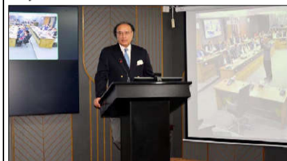
LAHORE: Federal Minister for Finance and Revenue, Senator Muhammad Aurangzeb, addressing participants of the 124th National Management Course during the "Strategic Policy Dialogue" at the National School of Public Policy, Pakistan Administrative Staff College Lahore.

The Punjab Governor said that whether the PPP is in power or not, it is always present among the people and raises its voice for their rights. The Punjab Governor said that the people of Okara have always expressed their trust in the PPP. He said that Chairman Pakistan People's Party Bilawal Bhutto Zardari is the voice of the aspirations of the people. The Punjab Governor said that Bilawal Bhutto Zardari will be the Prime Minister in the next elections with the people's mandate.