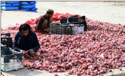
ISLAMABAD: Labourers sorting good quality of onions at Fruit and Vegetable Market.

On a year-on-year basis, major increases were observed in the prices of tomatoes (73.36%), wheat flour (33.82%), gas charges for Q1 (29.85%), chilies powder (15.20%), beef (12.70%), eggs (11.76%), bananas (11.67%).