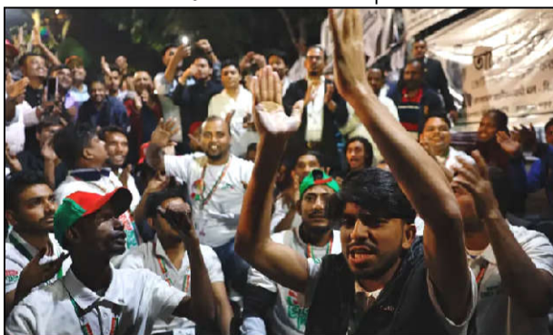
Supporters of the Bangladesh Nationalist Party (BNP) chant slogans as they celebrate news of Tarique Rahman's win in his constituency in the 13th general election near the party's Gulshan office in Dhaka, Bangladesh.

Critics say the restrictions are part of a broader campaign by Russian authorities to tighten control over internet use and more easily monitor Russian citizens online.