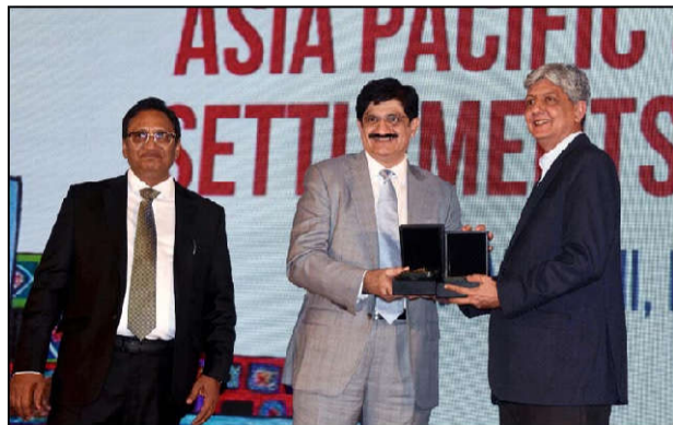
Sindh Chief Minister Syed Murad Ali Shah presents awards at Asia-Pacific Shelter and Settlements Forum 2026 in Karachi.

He also announced that the department's mobile application will be launched in March, allowing users to check bills and register complaints online.