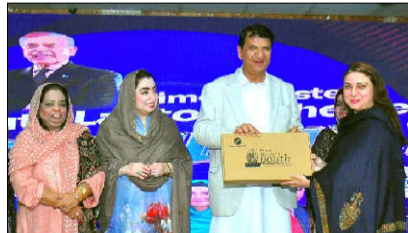
Federal Minister for Kashmir Affairs, Gilgit-Baltistan and SAFFRON, Engineer Amir Muqam, distributes laptops at Shaheed Benazir Women University in Peshawar.

The minister framed the ministry's approach in moral terms, telling reporters that "worship leads to heaven, while service leads to Allah," and said the ministry was guided by this principle in facilitating pilgrims. He also credited the Saudi-led "Road to Mecca" initiative with streamlining immigration procedures for Pakistani pilgrims departing from Karachi and Islamabad, allowing them to proceed directly to their accommodation upon arrival.