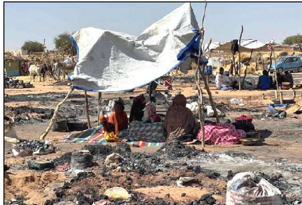
Refugees displaced from El-Fasher after its fall to the RSF sit in the shade in a lawila camp.

Over the past decade, the Independent National Electoral Commission (INEC) has introduced technology designed to improve the integrity of election results.