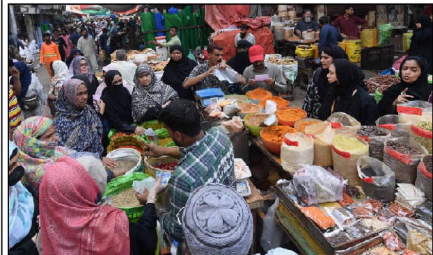
KARACHI: A vendor sells spice at a wholesale market in Karachi. Pakistan's weekly inflation rose by 0.09 percent ahead of Ramadan, ending three weeks of decline, with the Sensitive Price Index (SPI) reaching 333.79 points, according to the Pakistan Bureau of Statistics (PBS). Tomato, onion, and diesel prices increased, while wheat flour and eggs declined. Inflation rose across most income groups, recording a 4.84 percent annual increase.

With climate change, water scarcity, and land degradation increasingly threatening food security,