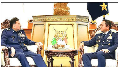
Air Chief Marshal Zaheer Ahmed Baber in conversation with his Indonesian counterpart during his visit to Indonesia.

During the discussion with the Indonesian Air Chief, both sides discussed enhanced Air Force-to-Air Force cooperation, joint training from basic to advanced levels, professional exchanges, and collaboration in emerging aerospace domains. The Indonesian Air Chief sought PAF's support in advancing operational and flying training, acknowledging PAF's rich combat experience. The Air Chief was conferred the Medal of Honour, the highest award of the Indonesian Air Force, in recognition of his role in strengthening bilateral air power cooperation. The Air Chief also held a joint meeting with the Indonesian Defence Minister and Chief of Defence Forces, where a wide range of defence and security matters.