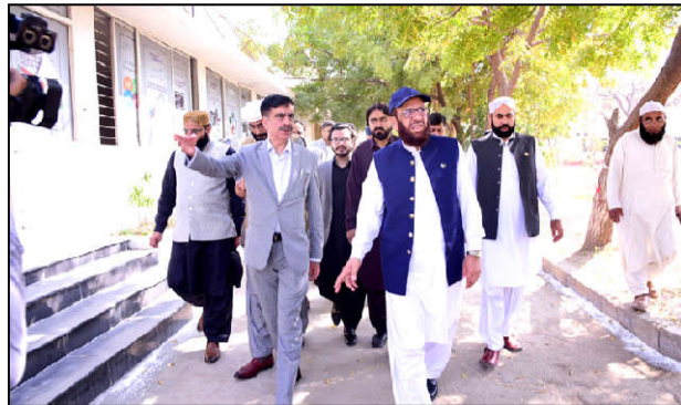
KARACHI: Federal Minister for Interfaith Harmony Sardar Muhammad Yousuf inspects facilities at Old Haji Camp during his visit to review arrangements for participants of the Hajj Training Programme.

Recalling his role in last year's Inter-Parliamentary Speakers Conference, he reaffirmed Pakistan's commitment to fostering closer coordination between the United Nations, the IPU and related parliamentary platforms to advance shared global objectives.