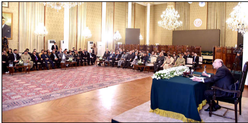
ISLAMABAD: President Asif Ali Zardari addresses the participants of the 6th International Workshop for Leadership and Stability (IWLS) during an interactive session at Aiwan-e-Sadr.