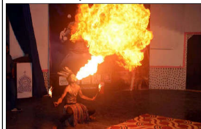
SARGODHA: Artist performs on stage during a cultural festival at the Sargodha Arts Council.

Security personnel deployed on duty during Iftar will be provided special arrangements for meals. Deployment of volunteers and private security guards will be done in consultation with local administration.