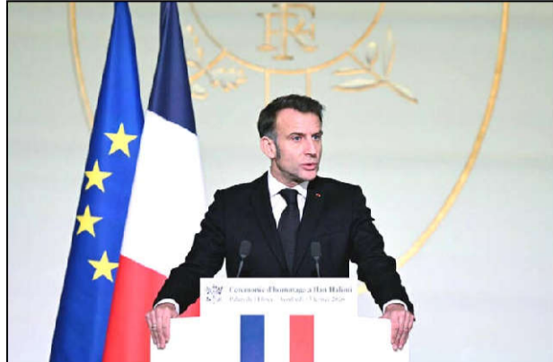
France's President Emmanuel Macron on Friday said he wanted "mandatory electoral bans" for officials guilty of "antisemitic, racist, and discriminatory acts and remarks."

That playbook proved devastatingly effective in the 2024 election cycle, when Fairshake poured money into races against candidates skeptical of cryptocurrency. Now spooked by the prospect of a repeat in AI, Anthropic has entered the fray. On Thursday, the company gave $20 million to a competing super PAC, Public First Action, which supports AI guardrails—effectively setting up a direct fight against Leading the Future.