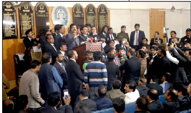
Governor Punjab Sardar Saleem Haider Khan addressing Okara Bar Association.

ISLAMABAD (INP): Indus River System Authority (IRSA) on Friday released 92,200 cusecs of water from various rim stations with inflow of 35,400 cusecs. According to the data released by IRSA, the water level in the River Indus at Tarbela Dam stood at 1486.07 feet which was 84.07 feet higher than the dead level of 1402.00 feet. Water inflow and outflow in the dam were recorded as 12,500 cusecs and 30,000 cusecs respectively. The water level in the Jhelum River at Mangla Dam was 1194.