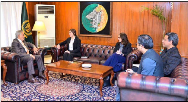
ISLAMABAD: US Chargé d'Affaires Natalie Baker meeting with Deputy Prime Minister and Foreign Minister Ishaq Dar.