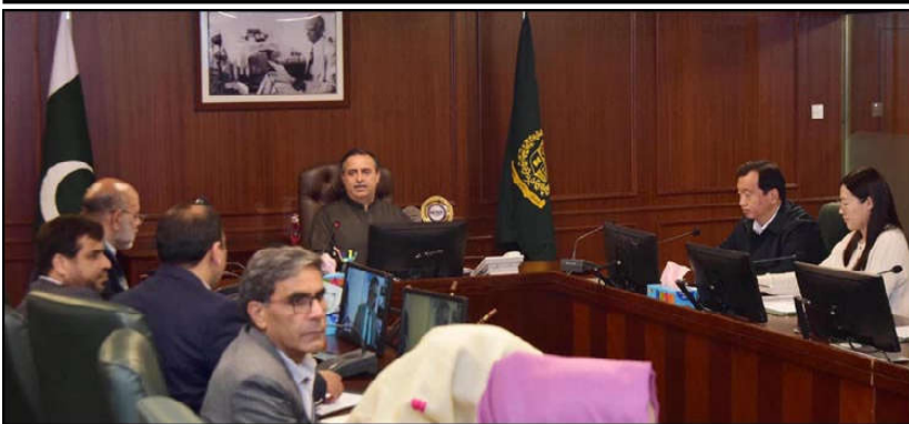
ISLAMABAD: Federal Minister for Maritime Affairs Muhammad Junaid Anwar Chaudhry chairs a high-level review meeting on the Sea-to-Steel initiative at Port Qasim.