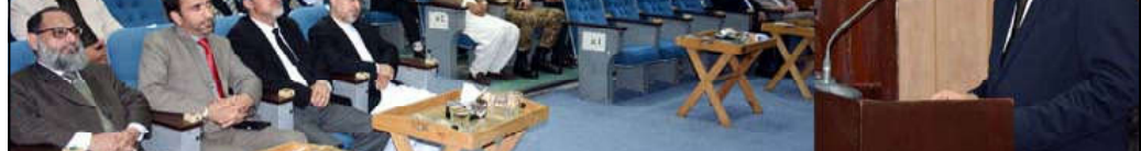
PESHAWAR: Governor Khyber Pakhtunkhwa Faisal Karim Kundi addressing Mediation Training Course ceremony at National Institute of Public Administration.

Maryam Nawaz also attended a special ceremony at the hospital marking the completion of 10,000 sur-