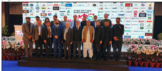
Participants in a group photo during Pakistan Sundar Industrial Expo 2026 concluding ceremony in which 500 companies participated.

The SBP accepted the entire amount of the 5 bids at 10.51% rate of return.