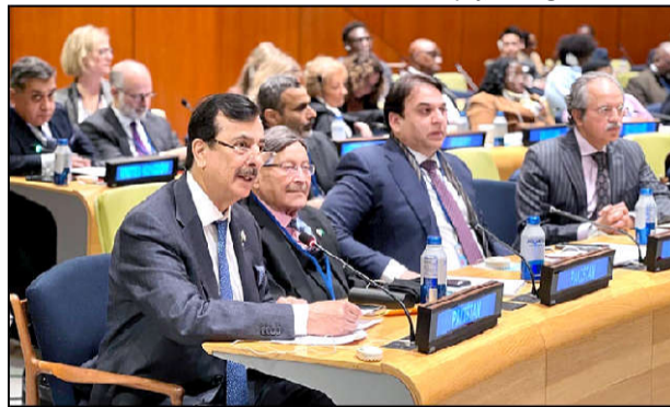
NEWYORK: A Pakistan Parliamentary Delegation led by Chairman Senate, Syed Yusuf Raza Gilani, addressing the 2026 IPU Parliamentary Hearing at the UN Headquarters.

Speaking on the occasion, the President of the UN General Assembly conveyed her condolences to the government and people of Pakistan on the loss of lives in the recent terrorist incidents in Pakistan. She said it is in the interest of all countries to fight terrorism together.