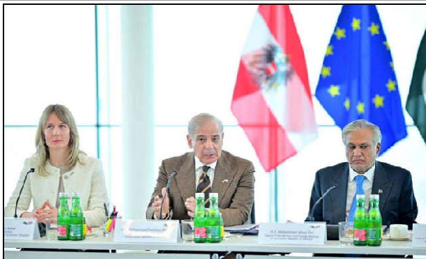
VIENNA: Prime Minister Muhammad Shehbaz Sharif addresses Pakistan Austria Business forum held at Federal Economic Chamber.

Meanwhile, silver prices also recorded a downward trend. The price of silver per tola decreased by Rs55 to Rs8,164, while 10 grams of silver declined by Rs47 to Rs6,999. In the international market, silver prices fell by $0.55 to $76.80 per ounce.