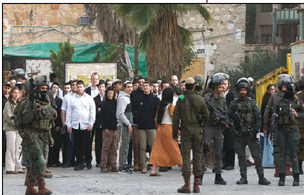
Israeli soldiers stand guard during a weekly settlers' tour in Hebron, in the Israeli-occupied West Bank.

"We are ready to train a new Gaza police force, and we are also ready to Palestinian police," Foreign Minister Antonio Tajani told a news conference in Rome. He confirmed that Rome ready to participate as an observer in US President Donald Trump's Board of Peace initiative, and Italy had been invited to attend a meeting of the group this week in Washington.