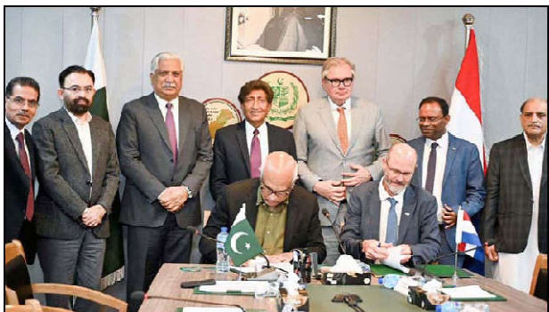
ISLAMABAD: Ministry of Water Resources and IHE Delft delegation sign MoU to strengthen Pakistan-Netherlands water cooperation, witnessed by Federal Minister for Water Resources Mian Muhammad Mueen Wattoo and Ambassador H.E. Mr. Robert-Jan Siebert.

He also expressed the resolve to combat illegal immigration in collaboration with partners like Austria, Germany and France.