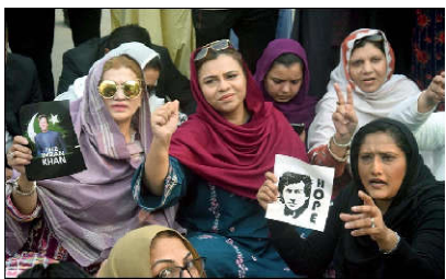
LAHORE: Members of Tehreek-e-Insaf (PTI) and Insaf Lawyers Forum protest over health concerns of PTI founder Imran Khan outside High Court in Lahore.

Criticizing the provincial government, he said the administration appeared indifferent to the difficulties being faced by citizens, particularly patients and elderly people affected by road closures.