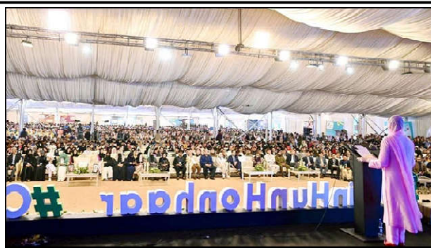
GUJRAT: Punjab Chief Minister Maryam Nawaz Sharif addressing the Honhaar Scholarships and laptops among students distribution ceremony.