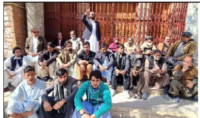
QUETTA: Members of consumer society protest against Quetta cleanliness project at Quetta Press Club.