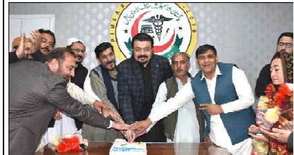
QUETTA: MS Civil Hospital and other officials cutting a cake during a ceremony to mark Paramedics Day organized by Pakistan Paramedical Staff Association.