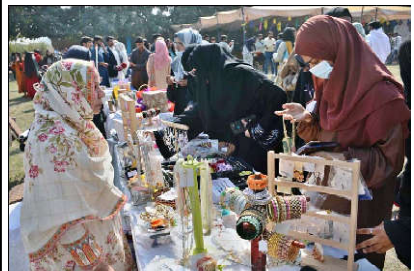
FAISALABAD: Students are visiting different stalls during the Gur Mela organized by Directorate of Farms at the University of Agriculture Faisalabad.