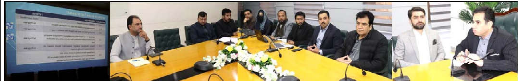
QUETTA: Commissioner Quetta Division Shahzeb Khan Kakar being briefed about Quetta Master Plan. Deputy Commissioner Mehruallah Badini is also present on the occasion

The district administration clarified that providing relief to the people during the holy month of Ramadan is the top priority and all possible steps would be taken in this regard and strict action to be taken against profiteers, no one could be allowed to profiteer during the month of Ramadan.