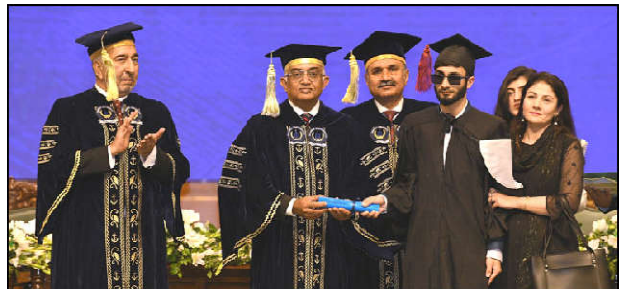
Chief of the Naval Staff Admiral Naveed Ashraf awarding degree during 28th Convocation Ceremony of Bahria University, Islamabad.