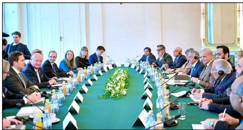
VIENNA: Prime Minister Muhammad Shehbaz Sharif in delegation level talks with Austrian Chancellor Christian Stocker.