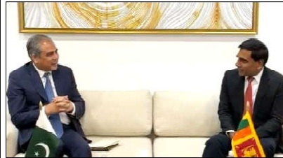
COLOMBO: Federal Interior Minister Mohsin Naqvi in a meeting with Sri Lankan Minister for Home and Parliamentary Affairs Ananda Wijepala during his visit to Sri Lanka.

He reiterated Pakistan's firm commitment to continuing joint efforts to further strengthen this partnership in all fields.