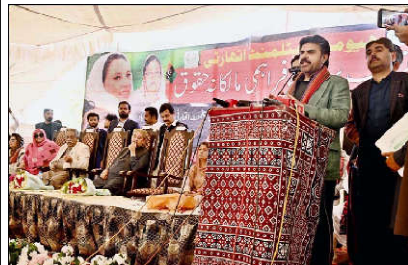
HYDERABAD: Sindh Minister for local government Syed Nasir Hussain Shah addressing during ceremony to distribute ownership certificates among slum dwellers at SRTC ground.

Abbasi said that projects related to upgradation of hospitals, establishment of new health centres, expansion of wards and provision of modern medical equipment across Punjab had either been completed or were under construction.