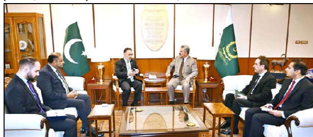
ISLAMABAD: Chief Justice of Pakistan, Mr. Justice Yahya Afridi, in a meeting with His Excellency Mr. Irfan Neziroglu, Ambassador of Türkiye to Pakistan who paid courtesy call on the Hon'ble Chief Justice of Pakistan at Supreme Court of Pakistan.