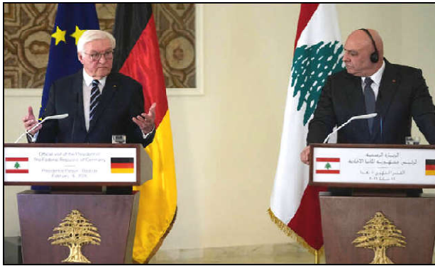
German President Frank-Walter Steinmeier speaks during a press conference with his Lebanese counterpart Joseph Aoun, at the presidential palace in Baabda, east of Beirut, Lebanon.

So far, few countries have publicly expressed interest in joining such a force, and Thursday's meeting might make things clear in terms of individual commitments.