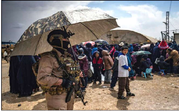
Members of Syria's Kurdish Internal Security Police Force and the Kurdish-led Syrian Democratic Forces stand guard during a joint security operation at Camp Roj, in the countryside near al-Malkiyah in Syria's northeastern Hasakah province, Syria.

According to him, the main cause of illness and mortality following burn injuries is infectious complications, since thermal trauma significantly weakens the body's immune defenses. At present, the mechanisms of immune protection in burn patients are still insufficiently studied, and specialists are searching for ways to improve treatment effectiveness, the researcher noted.