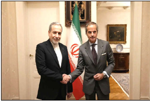
Iranian Foreign Minister Abbas Araqchi meets with International Atomic Energy Agency (IAEA) Director General Rafael Grossi in Geneva, Switzerland.

The far right has blamed the killing on la Jeune Garde (Young Guard), an anti-fascist youth group co-founded by an LFI lawmaker before he was elected to parliament.