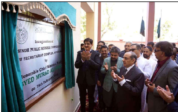
HYDERABAD: Sindh Chief Minister Syed Murad Ali Shah inaugurates Sindh Public Service Commission Secretariat Complex in Hyderabad.

At Khawaja Muhammad Safdar Medical College Sialkot, 98 students received laptops and 66 scholarships, while 1,025 students of government colleges received laptops and 216 scholarships.