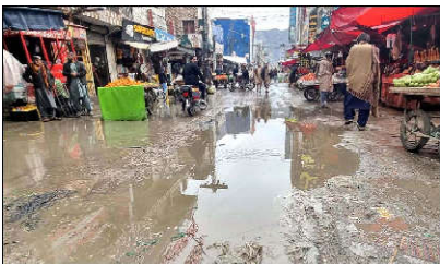
QUETTA: Stagnant rainwater in Quetta highlights negligence of authorities following downpour.

He highlighted that tree plantation not only enhances the natural beauty of an area but also plays a vital role in reducing environmental pollution by producing oxygen. A greener Chaman, he added, is essential for fostering positive thinking and promoting public health.