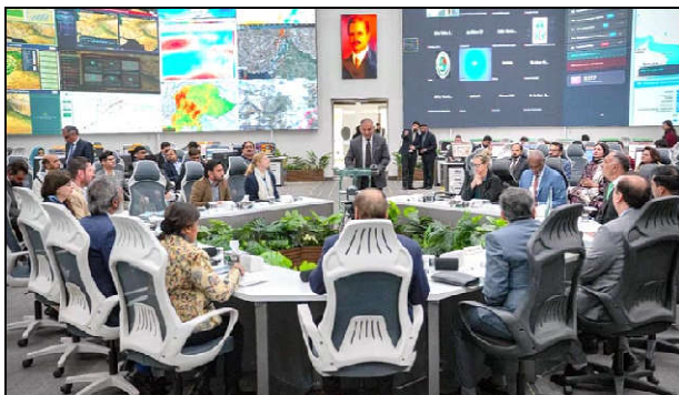
ISLAMABAD: NDMA conducted Humanitarian Conference on Sectoral Clusterization on Disaster Management at NDMA HQs.

The chief justice highlighted the historic and cordial ties between the two countries, rooted in shared legal traditions, mutual respect and enduring cultural bonds. He noted the expanding cooperation in areas such as technology integration within the judiciary, capacity building, and the exchange of best practices at various levels of the judicial system.