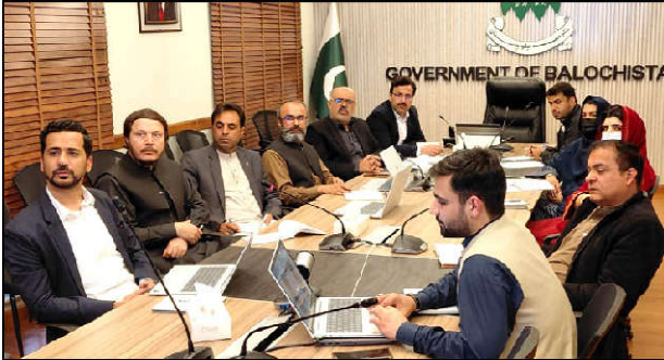
QUETTA: Finance Department Govt of Balochistan formally started preparation of Budget for the fiscal year 2026-27.