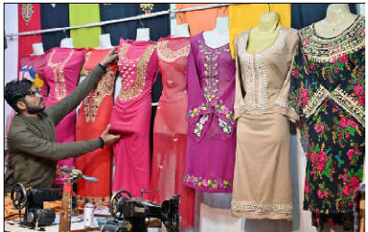
LARKANA: A shopkeeper displaying ladies clothes to attract the customers at Reshamgali.

The conference, he said, serves as a comprehensive roadmap for the state's economic progress.