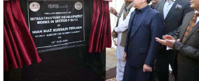
ISLAMABAD: Federal Minister for Housing & Works Mian Riaz Hussain Pirzada inaugurates development work in F-14 and F-15 sectors.

He expressed satisfaction that all sectors of the Federal Government Employees Housing Authority have started returning to track. Pirzada assured that all concerns of landowners and allottees would be addressed, fair compensation would be ensured, and the project would be completed within the stipulated timeframe. He said that, under the agreement, development work will be carried out by the National Logistics Cell (NLC), whose cooperation he described as commendable.